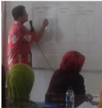
Figure 3. Teaching simulation teacher using PMRI model

And the last step teachers is teaching simulation. Figure 3 below illustrated elementary school teacher simulate mathematics learning process by using PMRI model and local genius as a context.