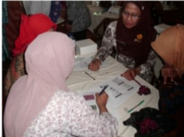
Figure 2. Designing mathematics learning process by using PMRI model

At the next step teachers discussed how to design local genius as a context on PMRI, then designing teaching materials and student activity sheets based PMRI, designing devices the elementary mathematics learning using PMRI models, and the sample of mathematics learning process by using PMRI model.