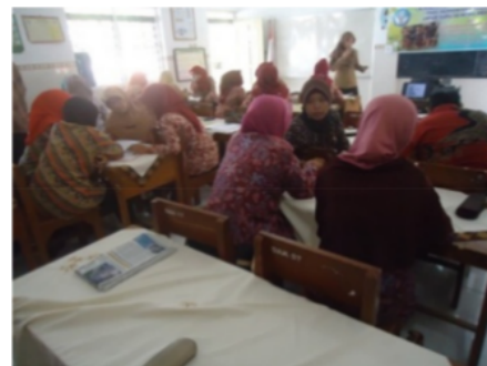
Figure 1. The implementation of PMRI training on MBS Forum

Figure 1 below illustrated the implementation PMRI training on MBS Forum teachers asked to think about PMRI model, PMRI definition, PMRI developmental history, and characteristics of PMRI.