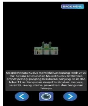
Figure 7 AR Camera the Mosque of the Tower of the Holy Mosque

AR 3D View Mosque Complex accompanied by a short description of the object. Can be seen in figure 7.