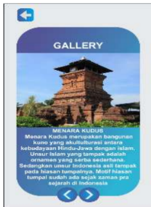
Figure 9 Gallery of the Holy Tower Compound

The gallery menu is a menu that will display the gallery menu of the Holy Tower along with a brief description. Can be seen in Figure 9.