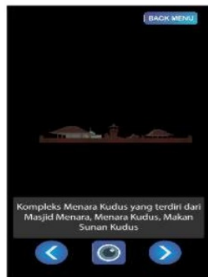
Figure 5 AR Camera Complex of the Holy Tower

3D View AR Complex The holy tower accompanied by a brief description of the object can be seen in Figure 5.