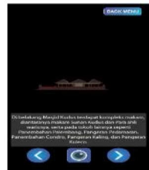
Figure 8 AR Camera Tomb complex of the Tower of the Holy

3D View AR Dining Complex accompanied by a short description of the object. Can be seen in figure 8.