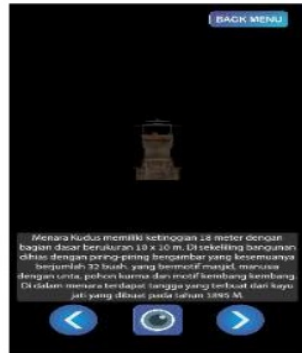
Figure 6 AR Camera Tower of the Holy

AR 3D View of the Holy Tower accompanied by a short description of the object. Can be seen in Figure 6.