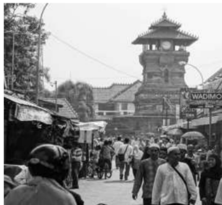
Figure 1 Environment of the Holy Tower

Preserving and publicizing the cultural heritage of the Tower of the Holy to be known by the wider community starting from the introduction of culture, the introduction of religious tourism to the introduction of the traditions that are in it. During this time the Tower of Kudus visited santri from across the archipelago in a religious tour of wali songo. To increase local and foreign tourists, the introduction of cultural heritage is packed in the latest technology.