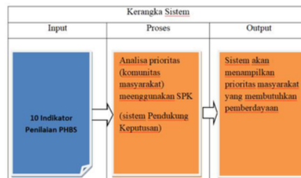
Fig 1. Information system framework.

At this stage the process of system analysis, and the following is an information system framework that can be seen in Figure 1: