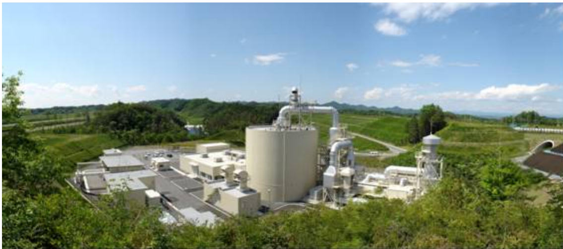
Figure 2: Photograph of Hy-SEF Facility.

To verify the fuel leakage standard hydrogen was leaked from the under floor of a vehicle at a flow rate exceeding 131 NL/min, which is the allowable hydrogen leakage rate from the collision of a compressed hydrogen fuelled vehicle in Japan. The resulting distribution of the hydrogen concentration in the engine compartment and the dispersion of hydrogen after stoppage of the leak were investigated. In addition, ignition tests were also conducted and the effects on the surroundings (mainly for people) were investigated to verify the safety of the allowable leakage rate. The tests demonstrated that if hydrogen leaks from the under floor of a vehicle at a flow rate of 1000 NL/min and is ignited in the engine compartment, people around the vehicle will not be seriously injured. Therefore, a flow rate of 131 NL/min, the allowable fuel leak rate for the collision of compressed hydrogen fuelled vehicles, assures a sufficient level of safety [4].