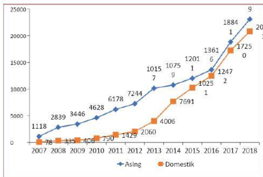
Figure 2. Visitors in Raja Ampat from 2007-2018 (FOLU, 2019)