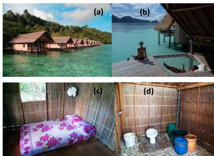
Figure 3 . Common homestay conditions in Raja Ampat

Mostly, homestays were built from timber and palm thatch. A completely traditional homestays constructed by bushed wood or sawn timber framed, floored with sawn flanks, the walls were originally made from palm thatch, and the roof without ceiling. A few have sand floors. The styles of traditional homestay was in variative, a single room with one window, to large four-roomed multi-windowed with verandas and perhaps a common room. Figures 3 shows the common homestay condition in Raja Ampat.