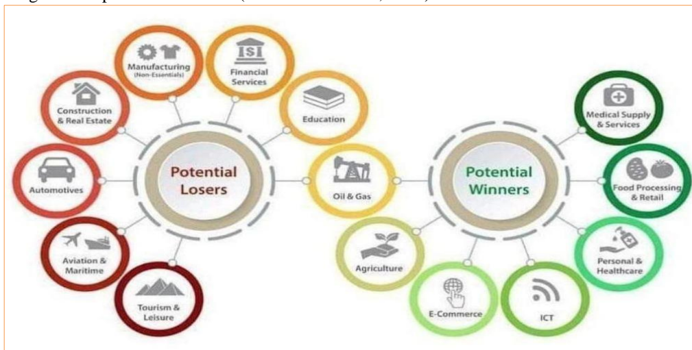
Figure 1. Decoding The Economics Of Covid-19: Potensial Winners & Losers In The Short Term

The Covid-19 mass pandemic scenario includes: (1) The epidemic handling and control period, so far all countries including Indonesia carry out activities of learning, working, and worshipping from home, always keeping a distance, always washing hands, keeping the environment clean, and always wearing a mask. Stop mass activities and close national borders, and continue to close every city, district and provincial border in Indonesia (Wu, Lin, Chien, & Hung, 2011). (2) Crisis period, after the era pandemic it is likely that a crisis will occur, if the pandemic is more than 6 months. Impacts in various sectors including the food sector will occur, this will result in diminishing food stocks while each country concentrates on the country and is still in the process of recovery (Rizal & Wedhaswary, 2020); (3) Socio-economic recovery period, in line with the rapid development of the pandemic covid 19, each country must prioritize public health, which in turn will have an impact on the socio-economic aspects. The Dcode 2020 analysis presents the sectors won and lost during a pandemic (Figure 1), it appears that food processing & retailing are included in potential Winners, in addition to the oil & gas, agriculture, e-commerce, ICT, personal & health care sectors, and supply & services medical. This can be the basis for the recovery of a country's socioeconomic conditions by presenting their respective characters (Baldwin & Mauro, 2020).