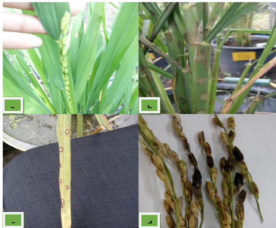
Figure 2. Good paddy leaves (a), Paddy which was attacked by Curvularia oryzae (b), Paddy leaves attacked by C. oryzae (c), Rice which was attacked by C. oryzae (d)

(variety of Inpari 30), P4 (variety of Inpara 5), and P5 (variety of IR 10) while P2 (variety of Ciliwung) occurred 15 days after inoculation. The dominant part of attachment occurred in plant stems (Figure 2) and leaves (Figure 2). Part of attachment looked like yellow after that there would be necrosis which made all leaves dry and dead. The spotting produced conidium and spreaded in other part of the plant such as leaves and stems and other part of rice plant. Infection would occur after plant produced the panicles. Infected rice grains would change to black chocolate in color. Infected rice grains would grow the miselium and formed heavy black coating (Figure 2). Infected rice grains would be easy to determine by color. Yellow color was uninfected plant. This disease could cause rice plant was not able to do photosynthesis as a result the plant would slow in growth especially panicles formation. Severe attachment would cause dead plant.