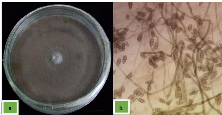
Figure 1. The growth of Curvularia oryzae on PDA media (a), conidia of C. oryzae with enlargement of 400x (b)

The result of identification of colony C. oryzae on PDA media was macroscopically gray to black in color such as the color of cotton and in the middle part were white (Figure 1), after identification by using microscope, the conidia was chocolate and had 3-4 septa. Usually, in the middle part of septa was bent in shape. In other word