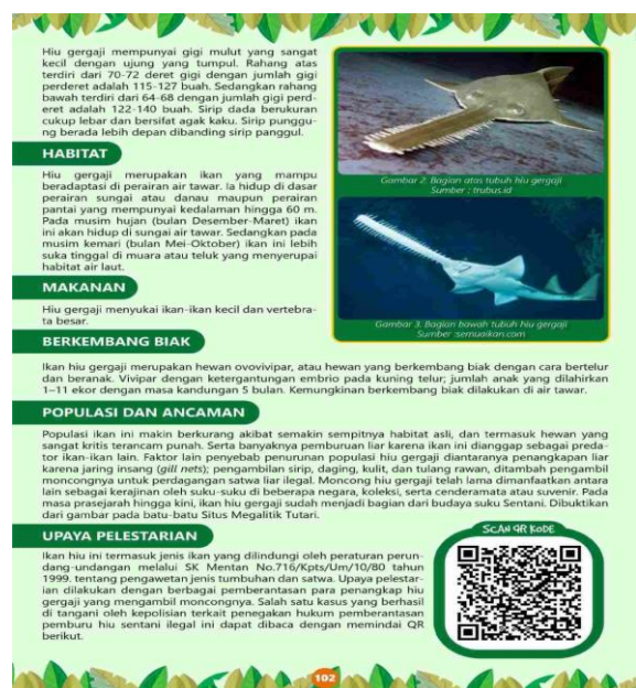
Figure 2. Book content example of Satwa Negeriku encyclopedia.

Content of the encyclopedia consists of some components (Figure 2), which are: 1) Book identity page explains book identity, such as book title, writer, designer, and layout designer of the book. 2) Introduction page contains writer's introduction about purpose and expectation for Satwa Negeriku Encyclopedia. 3) Content page contains list of contents from Satwa Negeriku Encyclopedia that can help user to find the desired page in the book. 4) Using QR code instruction page contains instruction using QR code in the book with the help of a smartphone. 5) Material page contains 15 endangered animal materials cover general condition, morphology, habitat, food, behavior, breed, population, and threat, as well as conservation effort. 6) Glossary page contains list of word/foreign term needed to be explained further. 7) Bibliography contains of bibliography and data source of the encyclopedia. 8) Writers identity contains short description of the writers' identity.