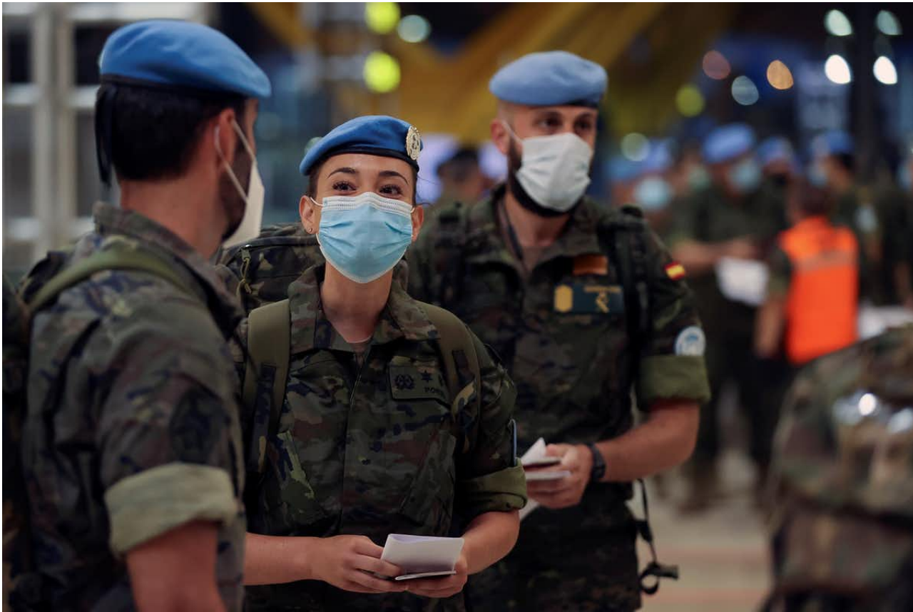
Spanish troops on their way to join the UN peacekeeping mission in Lebanon in July.