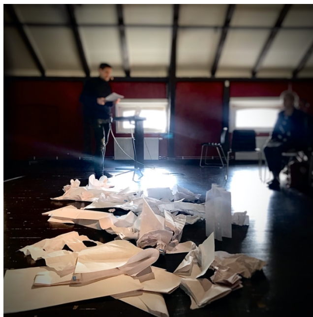
Figure 2. Pile of manifolds, photo by Krogh Groth

The space filled with two piles of white manifolds. The participants respected the imaginary line separating the two piles and placed their artefacts neatly on the designated pile. My performance lecture revolved around the concept of (mani)fold, as introduced by Deleuze and Guattari, 54 and the always necessary co-presence of smooth space (to simplify, a space of freedom and open distribution) and striated space (again to simplify, a space of structure and control). I do not know whether academic research is unproblematically thought of as striated while artistic research as smooth. The whole point of the performance lecture but also of the research that went into the preparation, was all about understanding manifolds as fractal iterations that carry on folding and unfolding (“how to continue the fold, to have it go through the ceiling, how to bring it to infinity” 55 ). This process is not in opposition to another process – say, smooth versus striated – but precisely a fold in itself. So, the further one moves into, say, academic research, the more iterative the manifold of the smooth and the striated, even within something that might initially give the impression of one rather than the other.