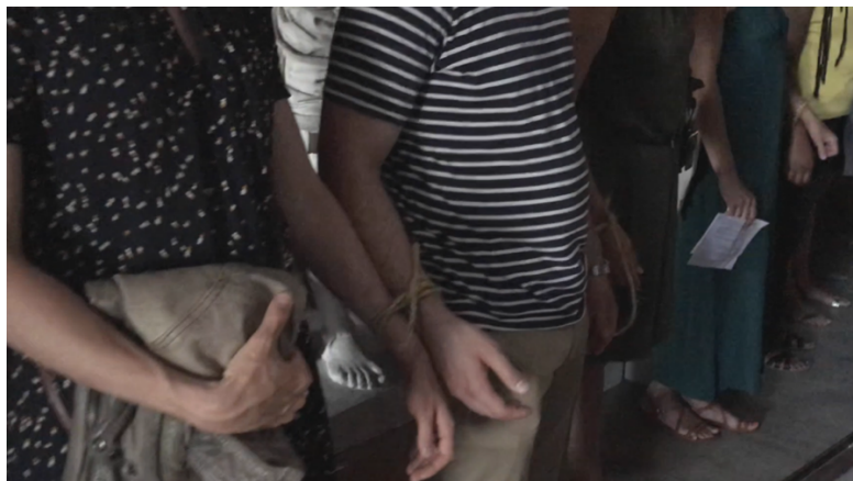
Figure 1. Rows of performance participants, still from video

The building becomes a slave ship, the audience the cargo, and we the ghostly materialisation of guilt. I come out of my hiding station. The place of my voice is now taken by the soundscape that sound artist Julie Nymann has created for this performance on the basis of the sounds of the actual collection building she recorded over the period of a week. 38 There is wind in that soundscape, openness violently rushing into small enclosures, a raging ocean, creaking floorboards, a solid aural materiality that conjures the ineffable. I walk amongst the orderly cargo just arranged by the evening's assistants: the audience is positioned in rows facing each other, following the well-known maps of slave ships indicating the best way to stack the slaves. We all know this, but not for this place! The audience are all tied up in pairs by their wrists, making sure that they stay put despite the waves, the dead bodies amongst them, the soaking seawater, the rats, the putrefaction. They are waiting, either to die or to reach the plantations and die there. We are deep in the metaphor. An estimated 32% of the slaves die in the three months the journey lasts. Onboard some ships, the percentage is even higher. 39