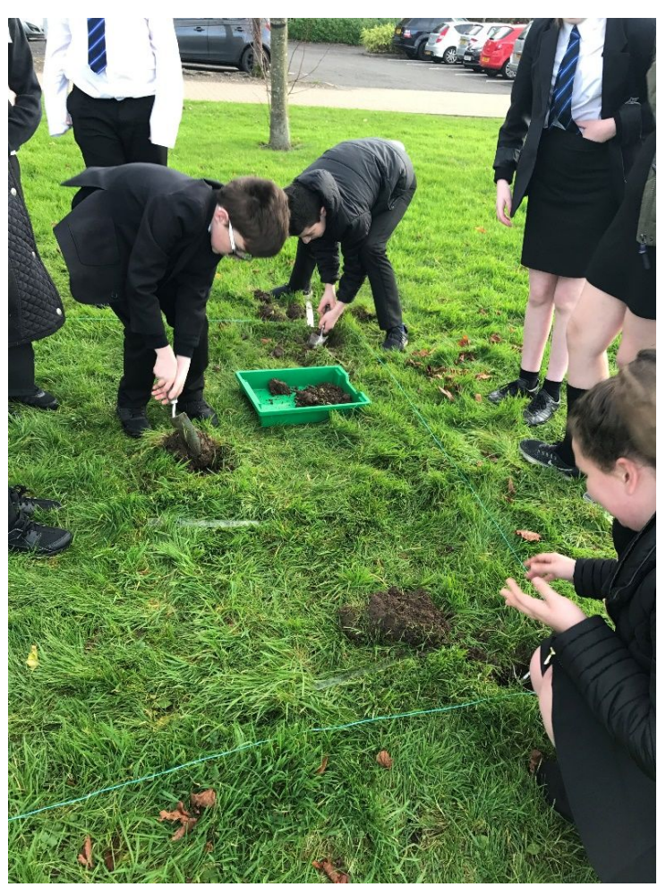
Figure 4. Pupils collecting soil samples

It was pleasing to note that 23.3% of the schools which submitted samples for this project are SHEP schools and included six FOCUS West, three LEAPS and one LIFT Off schools. The scientific results of this study have been published elsewhere<sup>34</sup> but generally higher metal concentrations were associated with locations close to the main urban area around Glasgow, with the lowest concentrations being found in areas further from the city. Reassuringly there was no evidence of significant health risk to school children who use these areas for recreation. The pupils and teachers engaged well with the protocol for collecting samples and shared their experiences through photographs (Figure 4). The protocol was clear and the instructions easy to follow with only one school making an error on the sample quantity required.