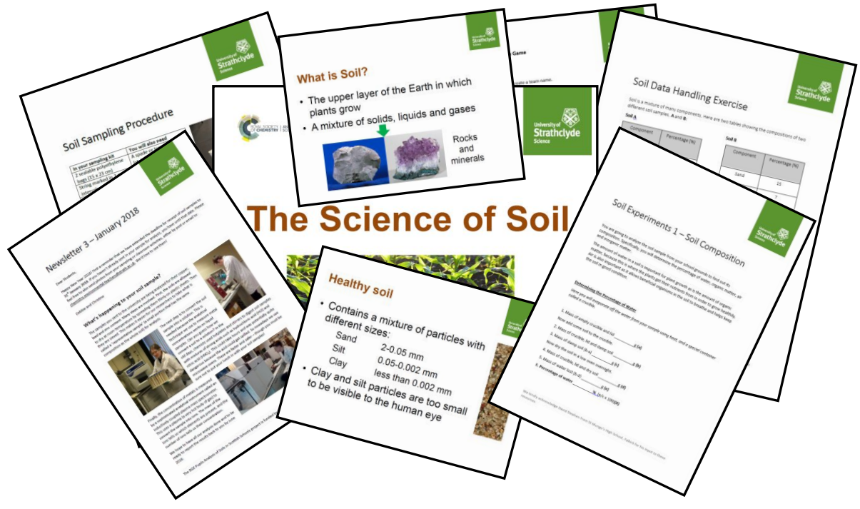
Figure 2: The range of core and optional resources

It was recognised that individual schools, indeed individual teachers, organise their curricula in different ways. This is particularly true since the introduction of the Curriculum for Excellence in Scotland where teacher autonomy is of paramount importance<sup>33</sup>. Thus, in order to facilitate a smooth integration of this project within the varied curricula across Scotland it was thought necessary to present a dynamic package of resources with which teachers could decide on the extent of their engagement. Specifically, a minimal core set of resources included an introductory presentation detailing information about the science of soils together with the soil sampling activity. The optional additional resources included a quiz game, two experiments, a data handling exercise, the monthly newsletters and the summary data reports (figure 2). A brief description of each is detailed below.