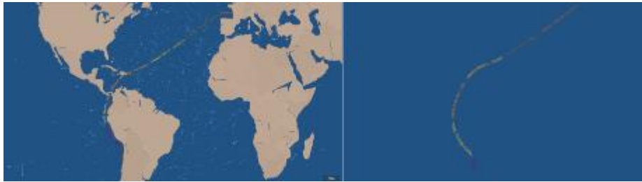
Fig. 2. Winnipeg captured in Conifer (l) vs ACT (r). In both cases, the coloured text remains dynamic, but in ACT, background images and additional moving text is lost.

The vast majority of Bitsy works captured well with ACT, despite functionality being primarily based around the use of arrow keys. As with other itch.io works, those with the auto run feature enabled did not capture with ACT, but captured successfully with Conifer. Only one work made with RPG Maker was found during the course of this study, but this also captured with ACT and retained full functionality including point-and-click and arrow key controls, although not without some technical problems. For example, skipping the title sequence sometimes causes a crash in the captured version. Increasing the capture limit in ACT seemed to improve the capture - the work was fully playable from beginning to end without error, even if the title sequence was skipped.