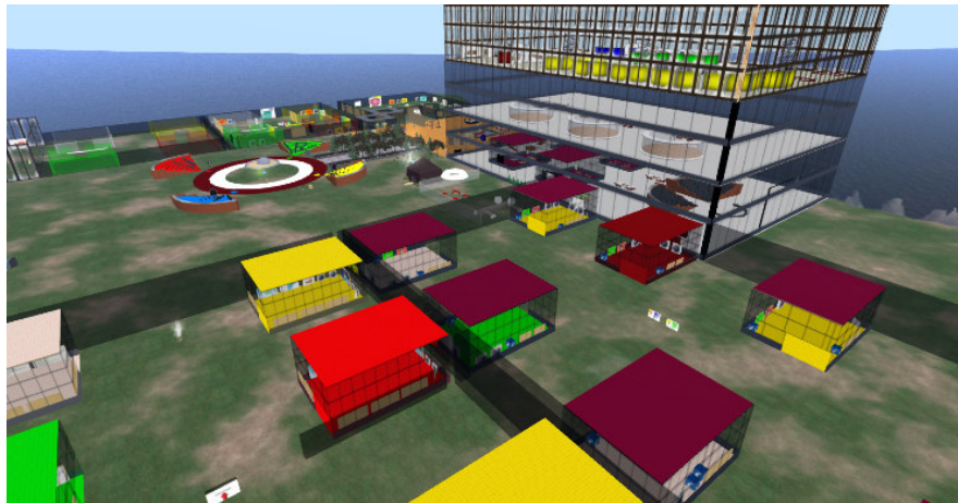
Figure 1: The VirtualSHU Virtual World