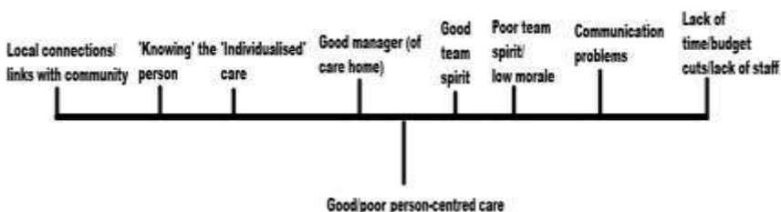
Figure 2. Discourses derived from themes emerging from folk domain analysis.