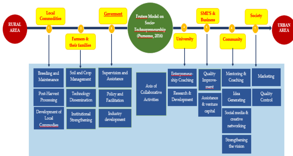
Figure 1. The Fruters Model (Purnomo, 2014)

The Fruters Model is a technopreneurship-based empowerment chain model that designed in the form of collaboration among various stakeholders so it gives broad impact from upstream to downstream (Purnomo, 2015). To know the extent of impact given by Fruits Up social business to the surrounding society, Fruits Up aims to measure social impact by using 10 parameter panel composed in social business model canvas including key partner, key activities, key resource, cost structure, customer segment (purchasers, user, stakeholder), customer relationship, channels, revenues stream, value proposition, and key metric.