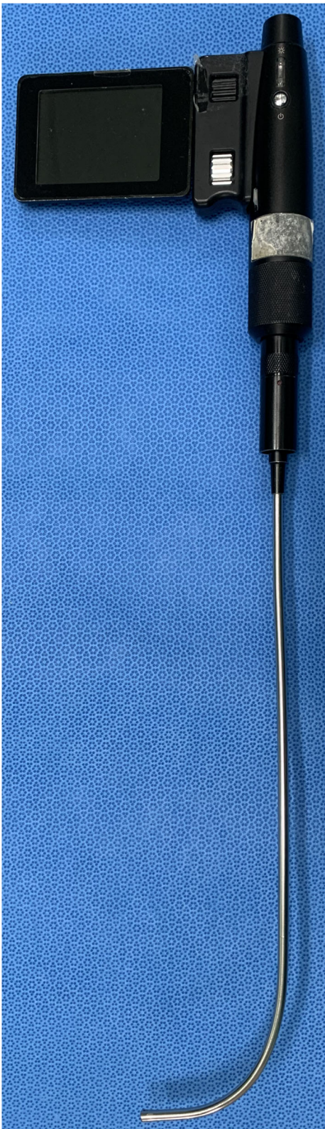
Fig. 1 The Optiscope™ used in this study. This videostylet has a rigid stylet that angled 90 degrees, with a camera lens at the bottom end and a handle and monitor at the top end