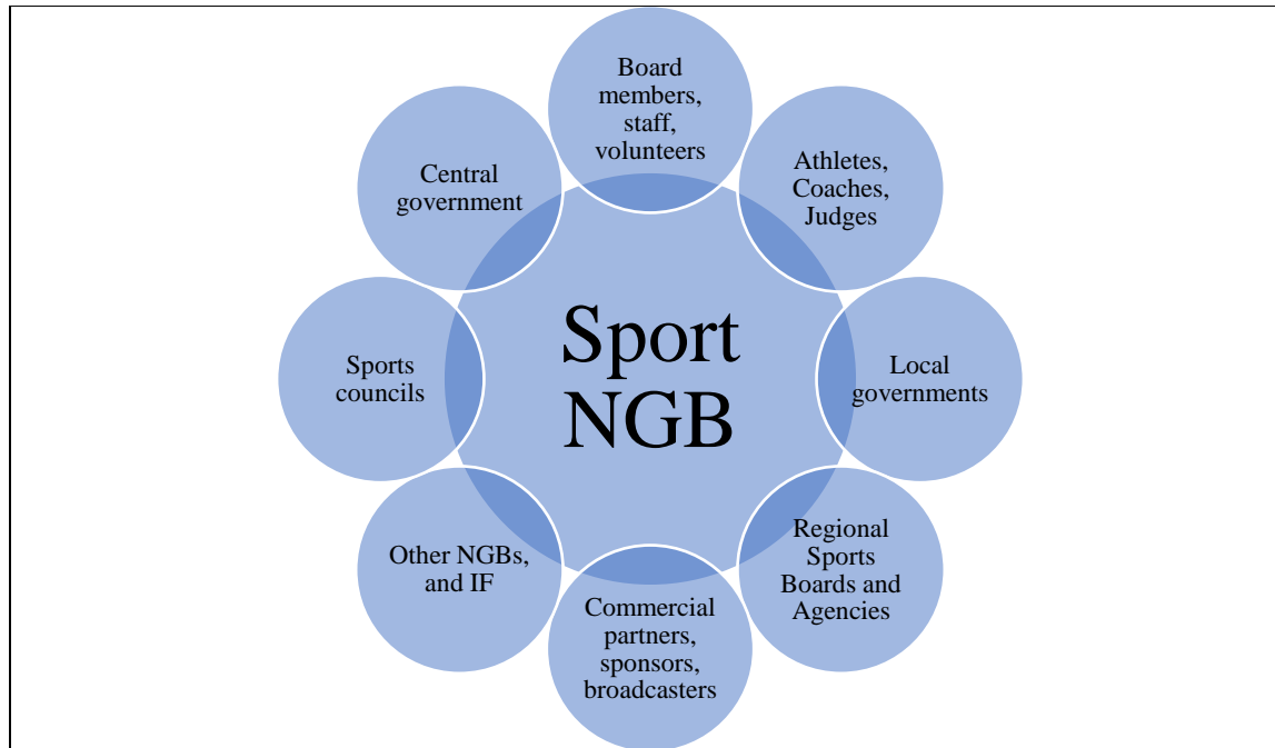
Figure 1. Stakeholders for NGBs