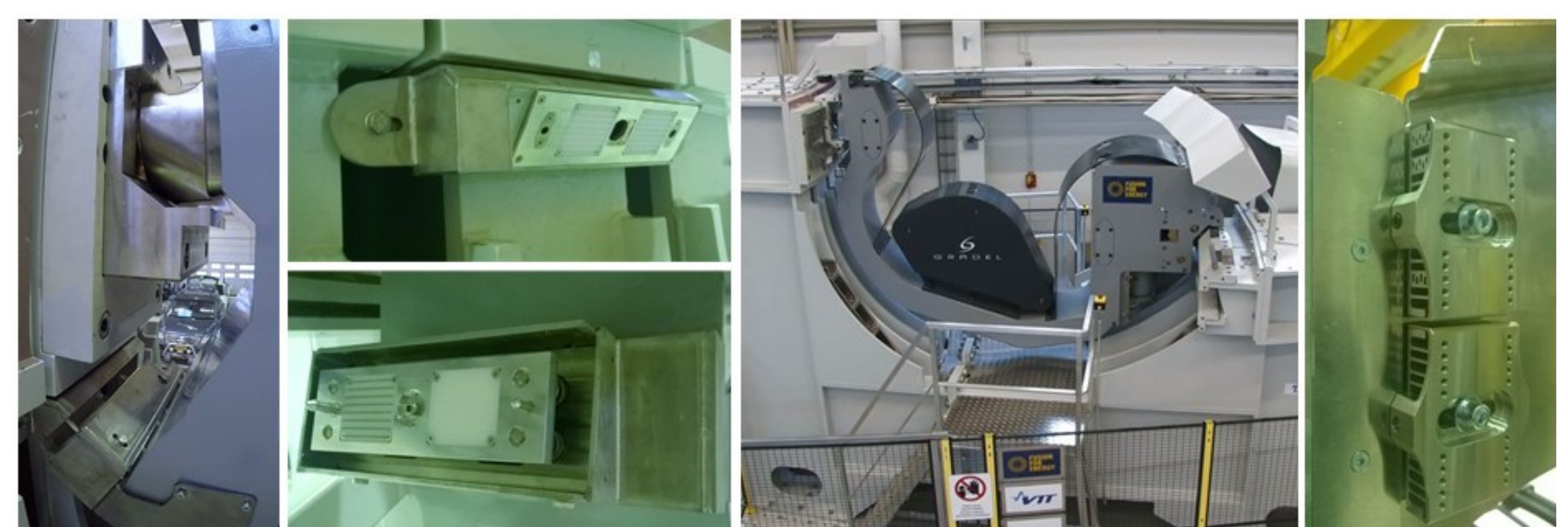
Inboard configuration mock-up demonstration in DTP2 environment