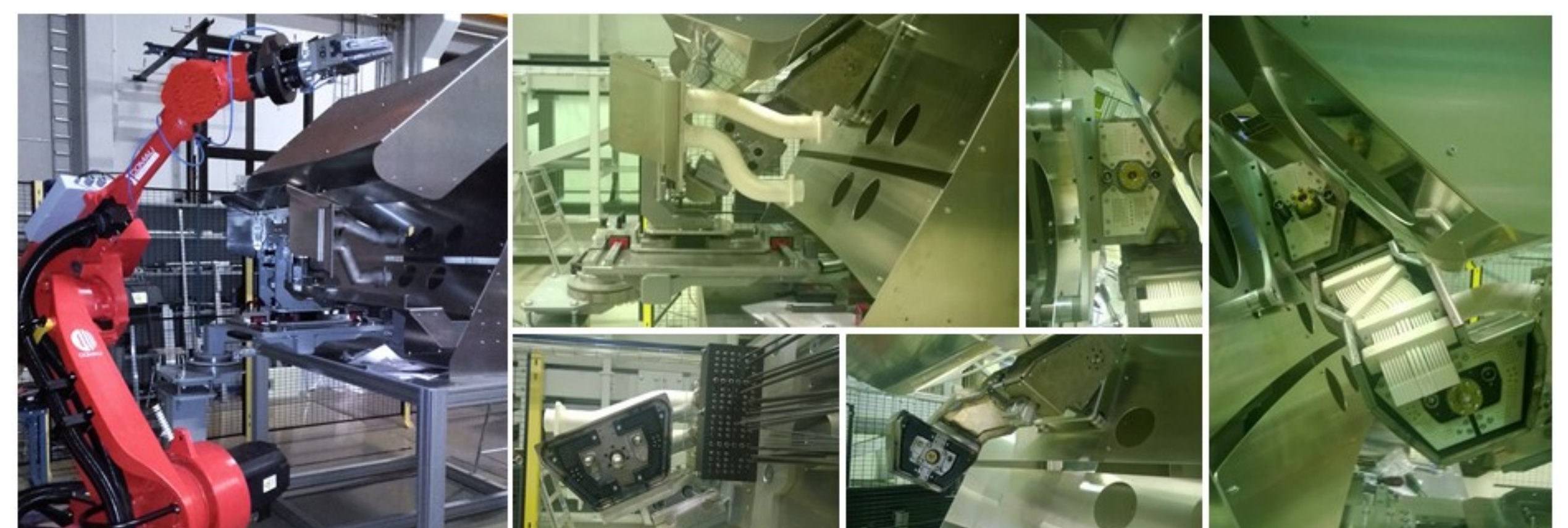
Outboard configuration mock-up demonstration in RHCP environment

Manufacturing and testing mock-ups verified the design alternatives and adaptation to remote handling. Test environments included Divertor Test Platform 2 (DTP2) and Remote Handling Connector Platform (RHCP) in VTT heavy laboratory.