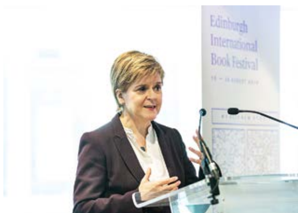
Nicola Sturgeon, Scottish First Minister

Members of the APPG asked the questions and facilitated the discussion with Tracy Brabin MP (chairing), alongside Giles Watling MP and the Earl of Clancarty. Discussions centred on the barriers facing working-class authors trying to break into a career in writing, the barriers producing unequal access to networks, forms of potential financial support, and the issue of 'London-based opportunities', as well as investigating government and other schemes to support early career creatives.