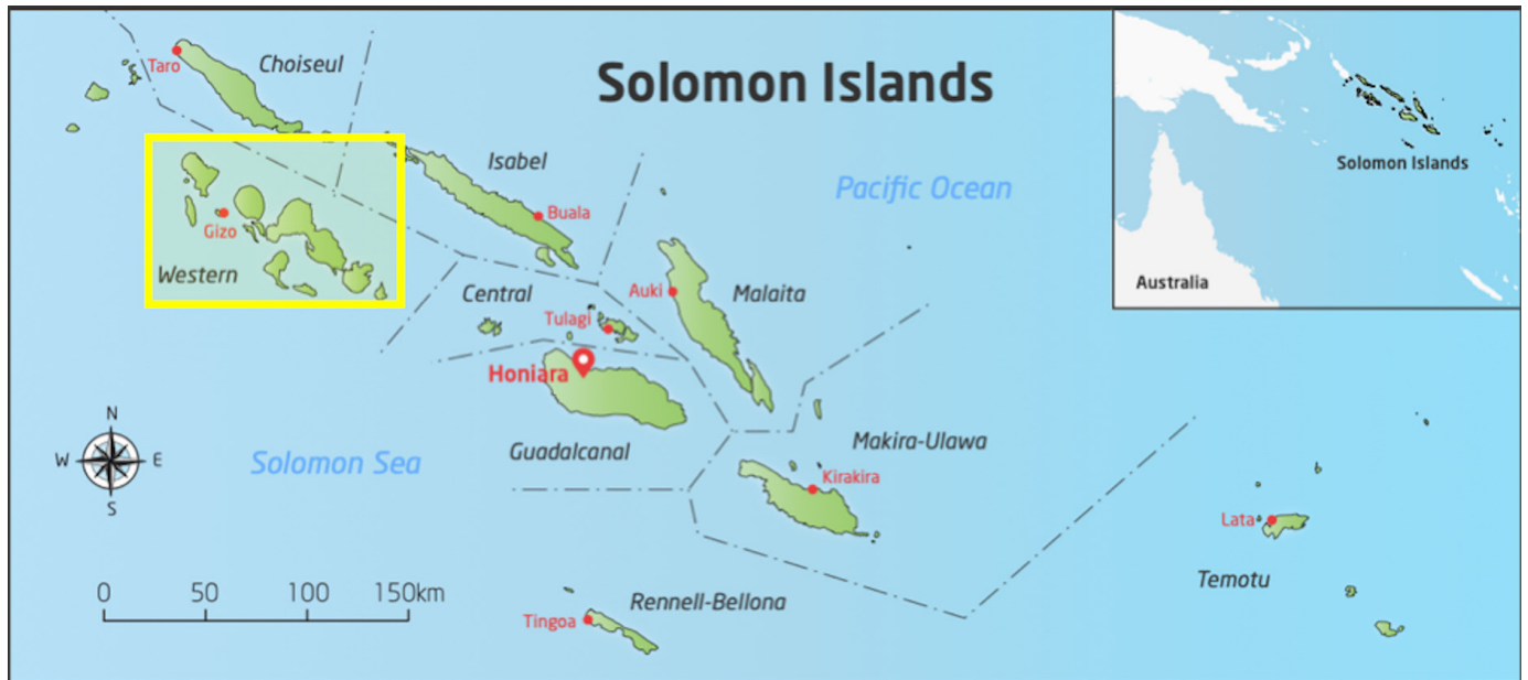
Figure 1 Study location in Solomon Islands.

This is a community-based study, with analysis conducted at the village level, and therefore, all residents are eligible to participate in the follow-up assessment at 12 and 24 months, regardless of whether they received treatment at baseline. Written informed consent will be obtained from all participants. Participants under the age 18 years will require written consent to be provided by a parent or guardian. Consent will be obtained at each study time point (baseline, 12 months and 24 months) (online supplementary file 1).