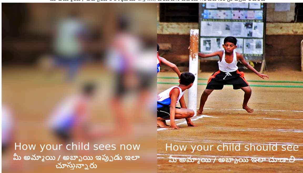
Fig. 2. Example of a PeekSim image – children playing 'kho-kho'.