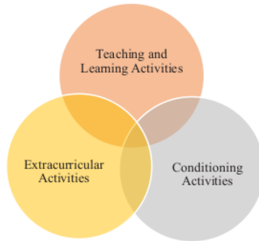
Figure 1: The pattern of the cultivation of the values of entrepreneurship