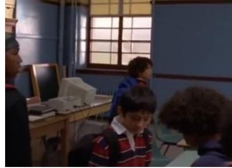
Picture 4. 3: The Student were surprised by their new decoration of the classroom