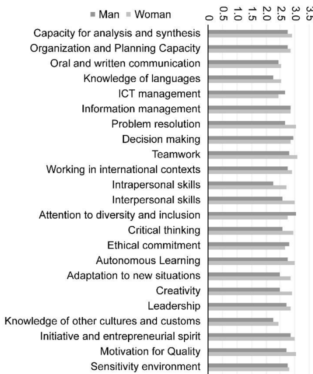
Figure 1.Level of transversal competences according to sex.

As shown in Figure 1, women reach higher levels in all transversal competences except for four of them, in which men reach higher scores: 1) information management (instrumental), 2) decision making (instrumental), 3) attention to diversity and inclusion (personal) and 4) ethical commitment (systemic).