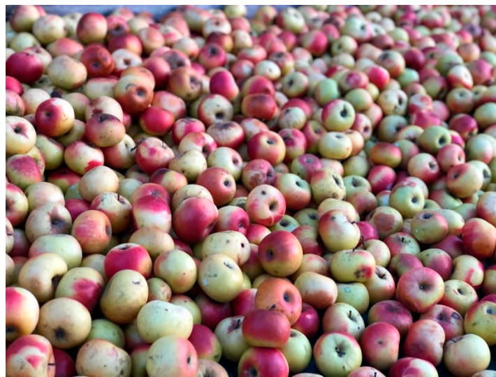
Figure 1. The Mela Rosa dei Monti Sibillini during its traditional storage at ambient temperature.

The Mela Rosa dei Monti Sibillini (MR) (Figure 1) is an ancient apple belonging to Malus communis Lam. (Rosaceae), which is cultivated between 400 and 900 m above the sea level (a.s.l.) in the Sibillini Mountains, Marche region, central Italy [6]. This small, flattened apple, endowed with a short peduncle, has been cultivated in this area since the Roman period. Its peel has a greenish colour with shades ranging from pink to purple, an intense and aromatic fragrance, and an acidic and sweet taste. This apple variety is well adapted to the local climate of the Monti Sibillini area [7].