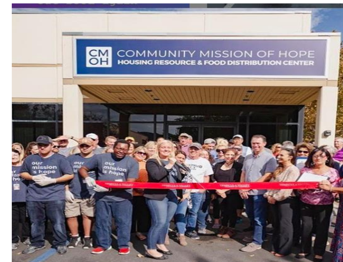
CMOH 10 Year Anniversary Ribbon-Cutting Ceremony

The research and needs assessment delivered to CMOH have demonstrated that occupational therapy would be a beneficial service for this site. Although the office is temporarily operating at half-capacity for CMOH due to COVID-19, program development has been initiated for allowing Level II students from the University of St. Augustine complete fieldwork at this site in the future.