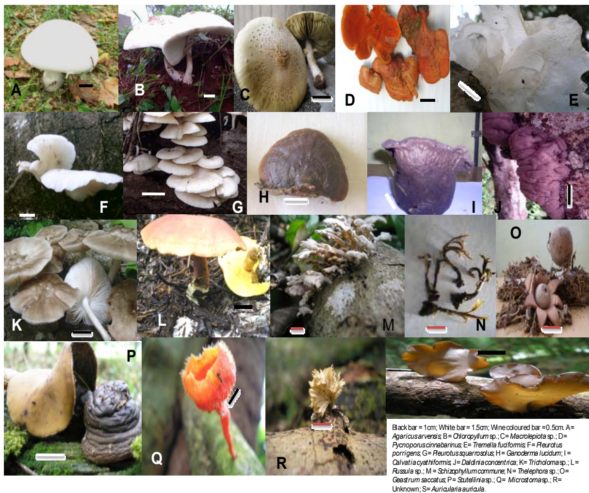
Figure 2: Some exotic, medicinal, edible and economically valuable mushroom resources found in Nigeria.