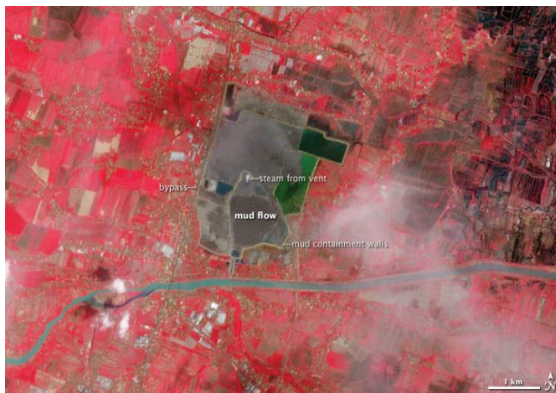
FIGURE 5. Photo of mudflow [7]