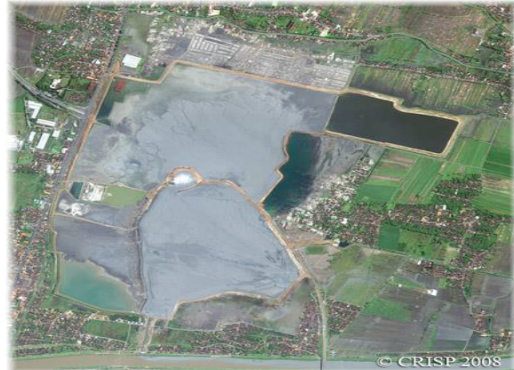
FIGURE 4. Photo in 2008 [7]