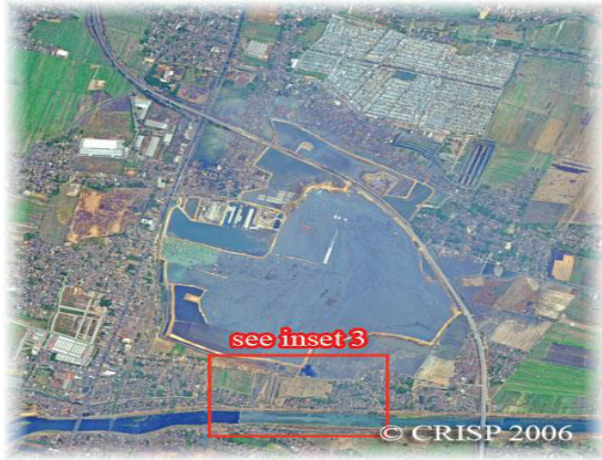
FIGURE 3. Photo shortly after the event of mudflow accident [7]