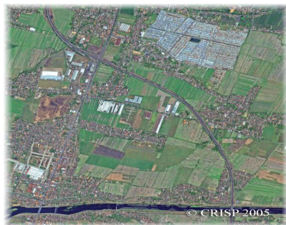
FIGURE 2. Photo before mudflow accident [7]