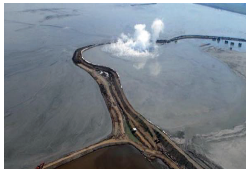
FIGURE 7. Recent photo of mudflow [7]

New innovations should be implemented in order to ensure the strength of construction materials as well as a fixed percentage of mortar materials to meet the standards on irrigation channels. If this research success, the national innovation will succeed also. Finally, the Sidoarjo mudflow as seen in Fig. 7 does not get worse.