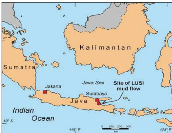
FIGURE 1. Location map of mudflow [7]

The mudflow location map is presented in Fig. 1 while the change of the situation since 2006 are shown in Fig. 2 to Fig. 6.