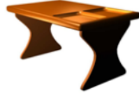
Figure 7. Selected table design.

From the calculation results of the evaluation matrix, it can be concluded that the most desirable design is design A, namely the design of a laptop table equipped with a place for food and drink.