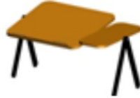
Figure 4. Model C design

This laptop table is designed with a space for laptop that can be adjusted. It has brown color and is made of wood. It was chosen by 10 respondents.