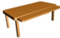
Figure 6. Model E design.

The figure shows the design of laptop table with a place for food and drink that can be pulled forward. It has brown color and is made of wood. It was chosen by 8 respondents.