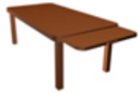
Figure 5. Model design D.

Here is the design of a laptop table with a place for food and drink that can be pulled sideways. The color is brown and is made of wood. 9 respondents chose this design.