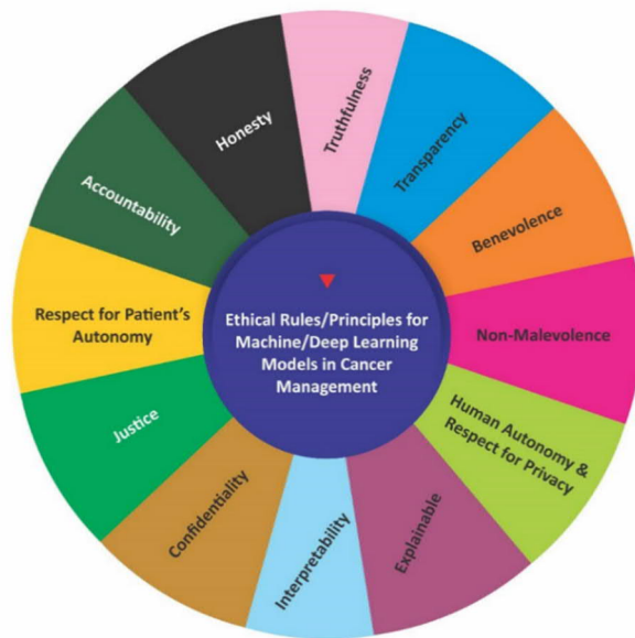
Figure 4. The fundamental ethical principles expected from the clinician and the ML model.

Aside from these ethical guidelines, corresponding laws (internal framework and international sphere) should be enacted by the government to ensure the legal (e.g., the European General Data Protection Regulations) (Flaumenhaft & Ben-Assuli, 2018; Vayena et al., 2018) and jurisdictional mechanisms for their enforcement (Robles Carrillo, 2020).