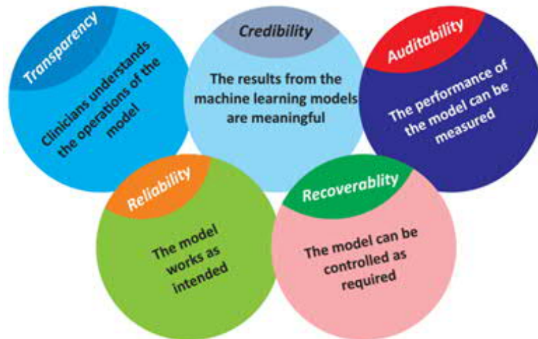
Figure 2. The trustworthiness principles expected from a ML model

It is important for the model to work as expected. Therefore, the model should have minimal errors in the training phase. Any form of error/malfunctioning of the model should be mentioned and defined (England & Cheng, 2019; Park & Kressel, 2018; Vayena et al., 2018; Zou & Schiebinger, 2018) to give transparency to the model and consequently, the results from these models (Geis et al., 2019; Park et al., 2019). Therefore, a possible imbalance in the data should be considered when developing the model to ensure the trustworthiness of the model. To address this challenge, related guidelines can be followed for transparent reporting (Bossuyt et al., 2015; Collins et al., 2015; England & Cheng, 2019). With these guidelines, the ML model deployed will be trustworthy and uphold the fundamental pillars of medical ethics (autonomy, beneficence, nonmaleficence and justice) (Arambula & Bur, 2020) and the ethical principles of transparency, credibility, audibility, reliability and recoverability (Keskinbora, 2019) (Figure 2).