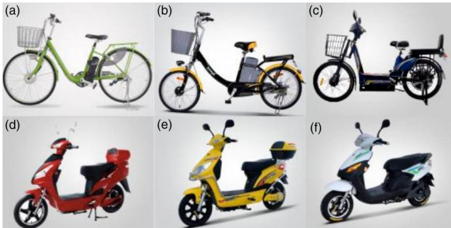
Figure 1. Different types of electric engine PTWs: bicycle-style in the top row and scooter-style in the bottom row (From Fishman and Cherry, 2016, included with permission from the Transport Review journal editorial office).

Although electric engine PTWs generally travel faster than bicycles, in most cities in China they are allowed to share infrastructure (like bicycle paths) with bicycles, which increases the complexity of the traffic situation (Cherry and He, 2010).