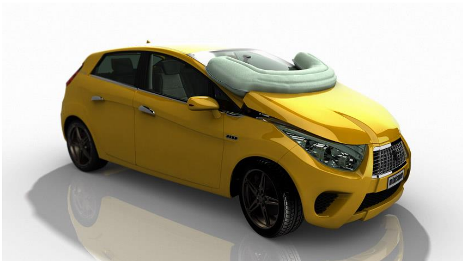
Figure 2. Windshield airbag for pedestrian protection: a TW-based protective safety system

Many studies have shown the effectiveness of these safety systems in reducing pedestrian injury risk, especially for the primary impact (when the car first hits the pedestrian) (Krenn et al., 2003; Bovenkerk et al., 2009; Huang and Yang, 2010; Fredriksson and Rosén, 2012a; Ames and Martin, 2015; Lim et al., 2015). To increase the system's injury reduction capabilities for TW riders, airbag coverage of higher parts of the windshield area has been recommended (Fredriksson and Rosén, 2012b). However, there is some evidence that the active pop-up hood and windshield airbag might not only fail to reduce injury risk when the pedestrian hits the ground (the secondary impact) but might even cause more severe injuries (Shi et al., 2019). More research is needed to determine the benefit of these safety systems in real-world traffic.