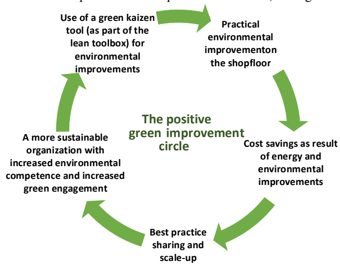
Fig. 3. The goal is to create the positive improvement circle.

The pilot demonstrated a practical and easy-to-use method to operationalize environmental strategies in a pharmaceutical producing company by using and slightly adapting a green kaizen method that was originally developed by and for the automotive industry. Improving the environmental sustainability cannot only be made by new green investments. It is clear that a lot of improvements can be made by changing behaviour in operations in the production context, see fig. 3.