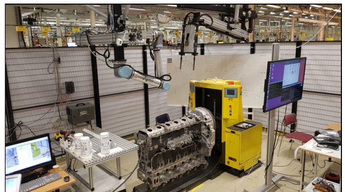
Fig. 1. Collaborative robot assembly station controlled by a network of ROS2 nodes.

interfaces, cameras, safety sensors, etc. Distributed large-scale automation systems require a communication architecture that enable reliable messaging, well-defined communication, good monitoring, and robust task planning and discrete control. In order to ease integration and development of different types of online algorithms for sensing, planning, and control of the hardware, various platforms have emerged as middle-ware solutions, one of which stands out is the Robot Operating System (ROS) [4].