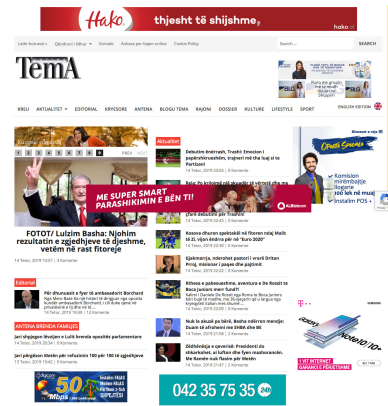
Figure 1: Motivating example of current filter lists’ regional inefficiency. Screenshot of Albanian website browsed with Adblock Plus.