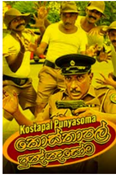
Figure 13: Example of an ambiguous ad image we encountered on a movie sharing forum in Sri Lanka as part of the its table of contents.