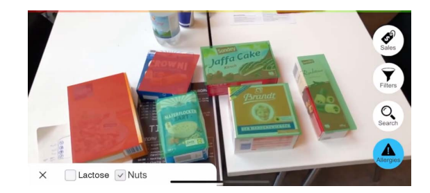
Figure 5: Warnings for items that contain nuts.

Many groceries possibly contain ingredients that affect users with different types of allergies. Therefore, it is possible to distinguish items that contain specific ingredients such as nuts. Items to avoid are shown in red and groceries that are fine in green. Figure 5 shows this distinction.