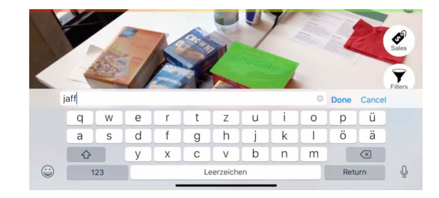
Figure 4: Search for items based on name or brand.

the search string as a substring. The product is then highlighted with a green rectangle making it very obvious where an item is placed. To do so, the color green is used and no distinction is made based on the confidence that a match is correct. Figure 4 shows this functionality.