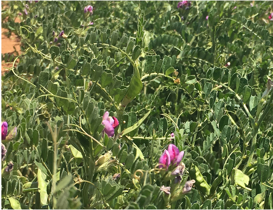
FIGURE 1 | Field grown Vicia sativa growing at the National Vetch Breeding Program in South Australia.

predominant non-essential amino acids within common vetch seed, averaging levels of 5.5 and 3.7%, respectively (Mao et al., 2015). Vetch seed also contains a much lower proportion of lipids (only 1.5–2.7%) compared with soybean seed ( Glycine max ) and this is primarily composed of unsaturated fatty acids (Mao et al., 2015).