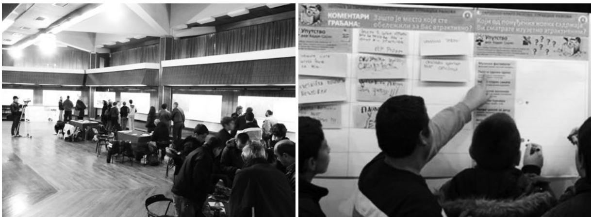
Figure 4. Alternative methods of active participation in the early stages of the planning process; “Speak Out” event in Majdanpek, PDR for development of the tourist area “Rajkovo”

Planning legislation in Serbia is recognisable in relation to the treatment of participation, through established instruments, procedures and mechanisms. Within formal practice, the main purpose of participation is to secure the legal right of participants to be involved in the planning process. Still, there is a general understanding that participation is a legal formality, and has not reached its full capacity within the planning context of Serbia.