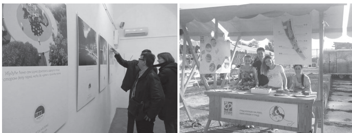
Figure 2. Alternative methods of informing in the early stages of the planning process

Besides traditional formal methods of consultation via public inquiry, and since 2014 early public inquiry, consultation with citizens in sub-municipalities is the most common example of acting beyond the minimal legal obligations in Serbia. Other alternative methods of consultation identified in local planning practice are: