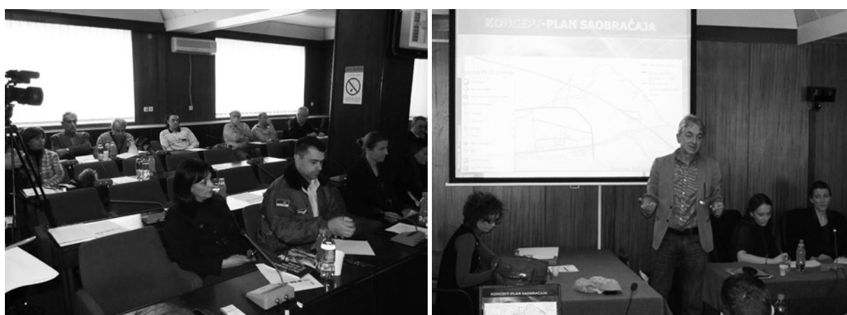
Figure 3. Alternative methods of consultation during formal planning procedures; Discussion between investors and representatives of the public sector in the early stage of drafting the conceptual design solution for the PGR “Industrial Zone – Sport Airfield” in Kraljevo (2012)