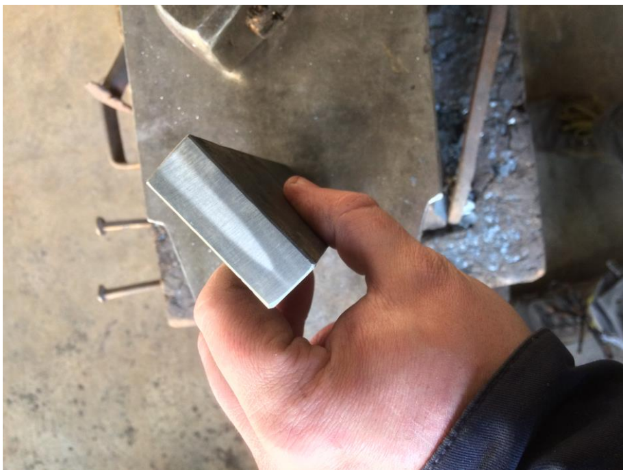
Fig. 4: Bulk pattern of the final billet.

According to the scientific research on period blades, the blade has been made from a billet composed of layers of carbon steel and wrought iron piled and forge-welded together. 7 The bulk pattern is an outer “skin” (with a V shape open on the back of the blade) with 460 alternate layers of wrought iron and carbon steel wrapped around a plain wrought iron core (Fig. 4).