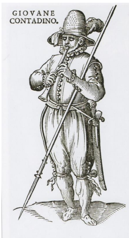
Fig.3: Engraving by Cesare Vecellio, 1590. Degli Habiti Antichi e Moderni. Venezia.