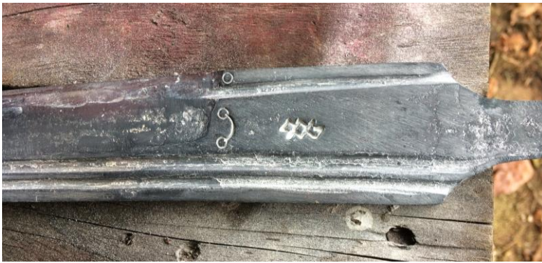
Fig. 9: Signatures on the blade.