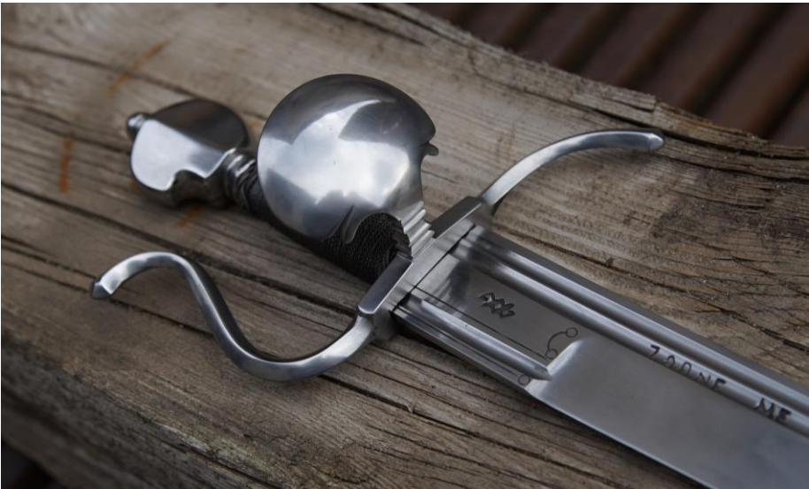
Fig. 15: Sword completed. ©Photo Alberto Dalla Valle.

It is certainly a satisfying result, but this sword should be considered only a starting point for further research about traditional techniques of sword-making.