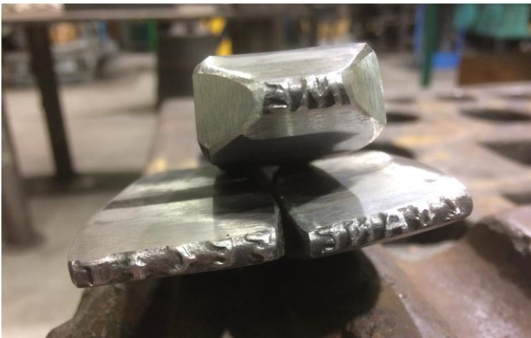
Fig. 8: Touch-marks to stamp ZOANE ME FECIT.

The stamps used on the copy have been made by hand by filing and chiseling: a half-moon, a circle, a mark inspired by belunese “knots” typical of north Italian sword-makers (that is my main mark), and three stamps to make ZOANE ME FECIT (I was made by Zoane) on the fullers (Fig. 8-9).