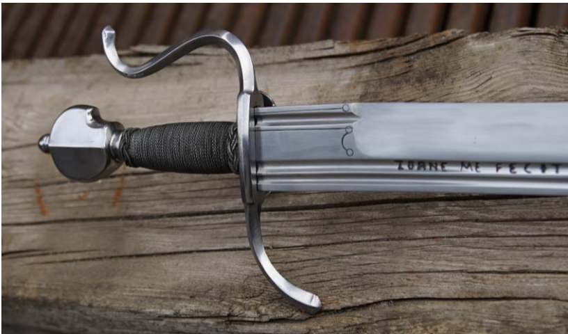
Fig. 13: Handle detail.

The handle has been made from a single piece of ash wood wrapped with iron wire. To make the central cavity for the tang, the wood has been first drilled and then the hole adapted (with the same shape of the tang) with a hot spine. The wood has been then wrapped with iron braid held in place by two Turk's heads knots on the ends. The Turk's head is a classic iron wire pattern in use on arms handles from the sixteenth century, and its main function was to avoid the wood handle splitting caused by the tang (Fig. 13).