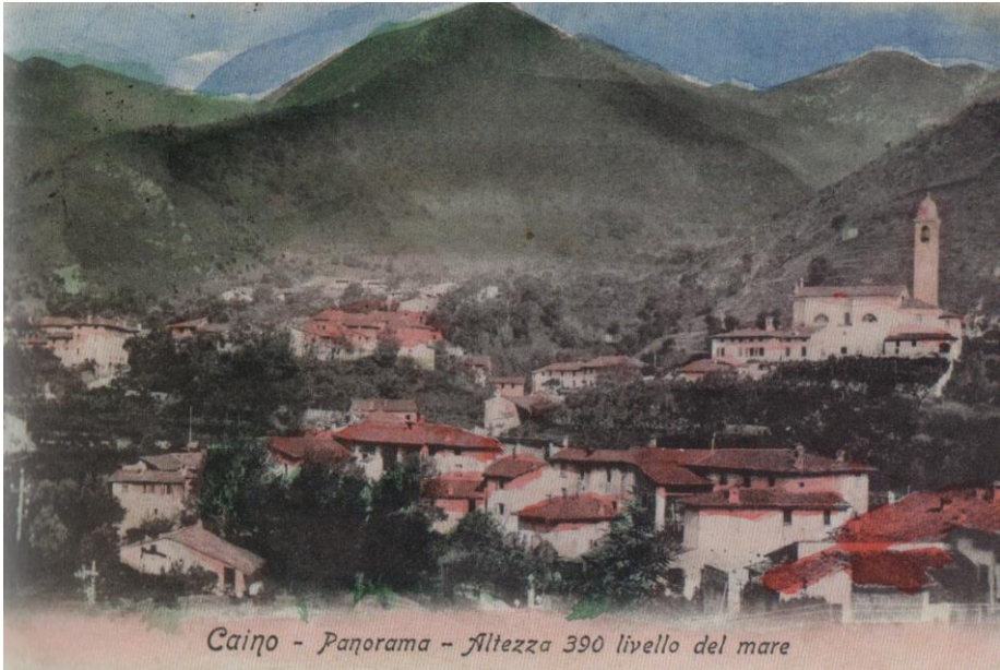
Fig. 2: Old postcard showing Caino Village. Reproduced from the book Caino (Gotti, 2011).

The blade is signed with the name F.TOMASO twelve times and of course the CAINO proof mark, with an overall length of 812 mm, a weight of 1018 gr and a balance point 107 mm from the guard. 1 The reason behind the choice of this sword as a model was not only how well preserved it is, but also the possibility to use the results of a metallurgical study made in the University of Brescia on a different, broken, storta sword made in Caino as well. 2