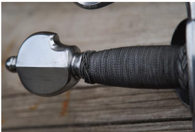
Fig. 10: Pommel detail, it is possible to observe delaminations and inclusions.

working operations the “poor” quality of the wrought iron has caused some evident delaminations easy to see on some original arms and armour too (Fig. 10).