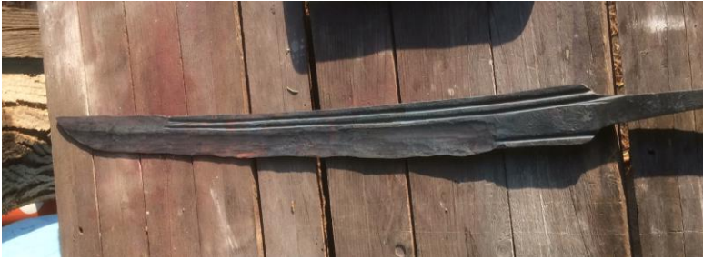
Fig. 7: Freshly forged blade.

have been: fullers forging (with specific dies under the power-hammer or top-bottom dies on the anvil), tang final shaping, straightening and adjusting curves (Fig. 7).