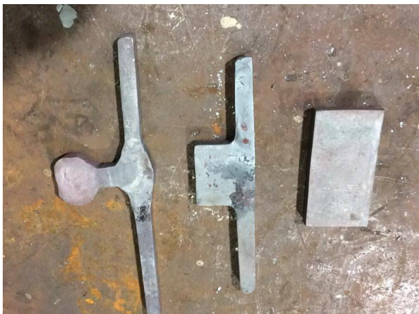
Fig. 11: Some forging stages of guard.

The guard was produced from the same carriage wheel that was used as the source for the pieces of the blade. This iron is much more homogeneous than the one used for the pommel but some delaminations became visible too during forging (Fig. 11).