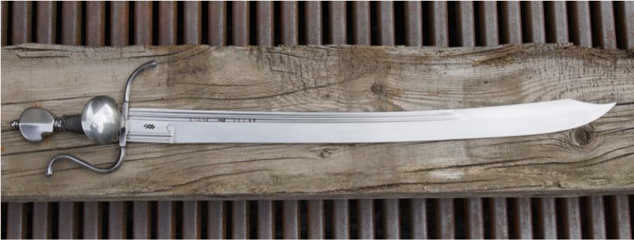
Fig. 14: Sword completed.

The result of the project has been a sword that is really close to the original on geometries forms and weights distribution (there is a difference of 4 grams between the original and the copy) (Fig. 14-15).