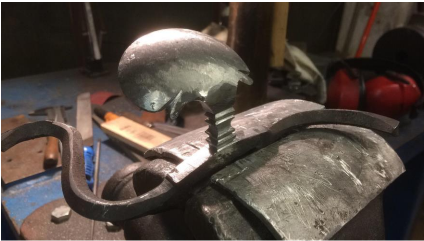
Fig. 12: Guard during file polishing.