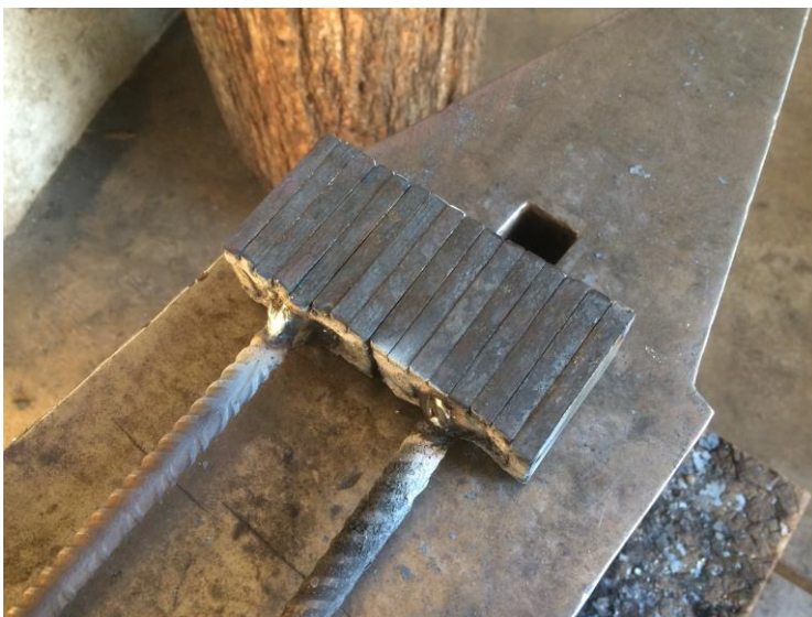
Fig. 6: Billets ready for forge-welding.