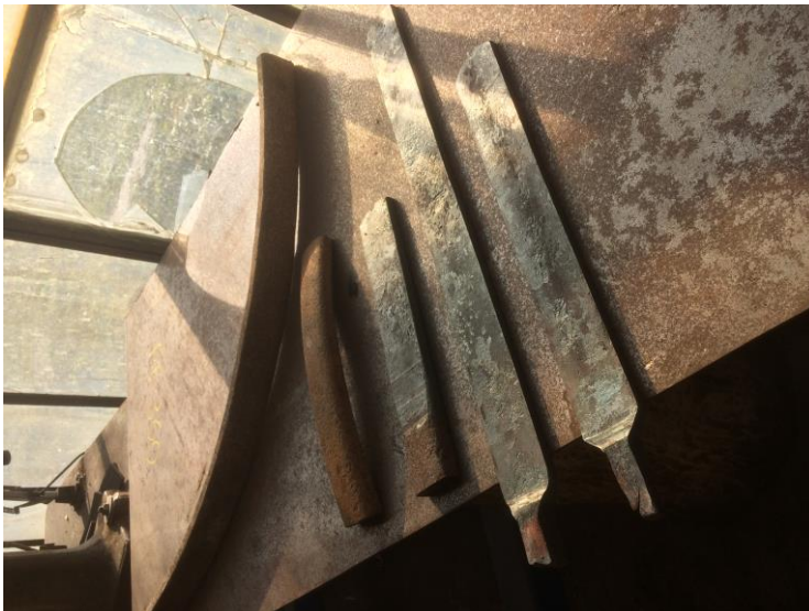
Fig. 5: Pieces from a XIX cent. carriage wheel. Starting material for blade and guard.

The wrought-iron chosen, from a 19 th century carriage, has been mixed with a plain carbon steel in alternate layers to produce two starting billets (Fig. 5). The two billets have been forge-welded, cut in many pieces and forge-welded together again several times for a final result of 460 layers on the edge (Fig. 6). The increasing of layer number and several forge-welding stages allow also diffusion of carbon from steel to wrought iron.