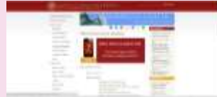
Markkula Center for Applied Ethics

http://www.scu.edu/ethics/practicing/decision/