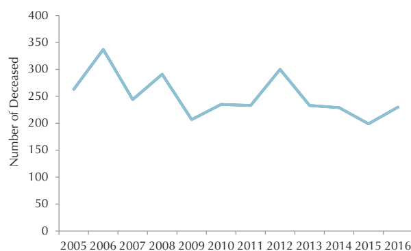
Figure 1. Frequency of the Deceased Population Because of Accidents and Driving Accidents Leading to Death in Chaharmahal and Bakhtiari Province During 2005 to 2016.

in 2008 and 2012, and the fewest were in the years 2009 and 2015 (Figure 1). During the last 12-year period, the rate of accidents has decreased significantly (Spearman's \rho = -0.65 , P=0.022 ). In terms of the distribution of the months of the year, the highest percentage of accidents belonged to the end of August and the beginning of September while the lowest percentage was related to the end of February and the beginning of March (Figure 2). In addition, the frequency of accidents leading to death indicated a significant change based on the month and the year ( P<0.001 ). Further, the frequency of deaths caused by accidents represented a significant difference when compared based on gender and marital status ( P<0.001 ). Based on the results, the highest frequency of deaths caused by accidents belonged to married men. Furthermore, the frequency of accidents leading to deaths based on age demonstrated a significant difference ( P<0.001 ), in which the highest frequency belonged to the age range of 21-25 while the lowest frequency was related to the age range of 11-15 and 80 and over. The frequency of deaths caused by accidents also had a significant difference when compared based on the level of education ( P<0.001 ). According to the data, the highest frequency was related to illiterate groups whereas the lowest frequency belonged to people with master's degrees and higher (Table 1). As regards