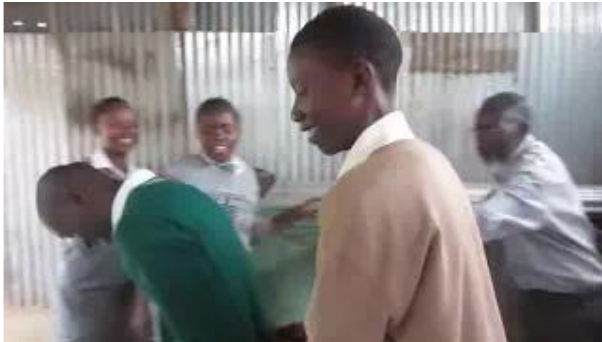
Post-Election Violence in Kenya - Video