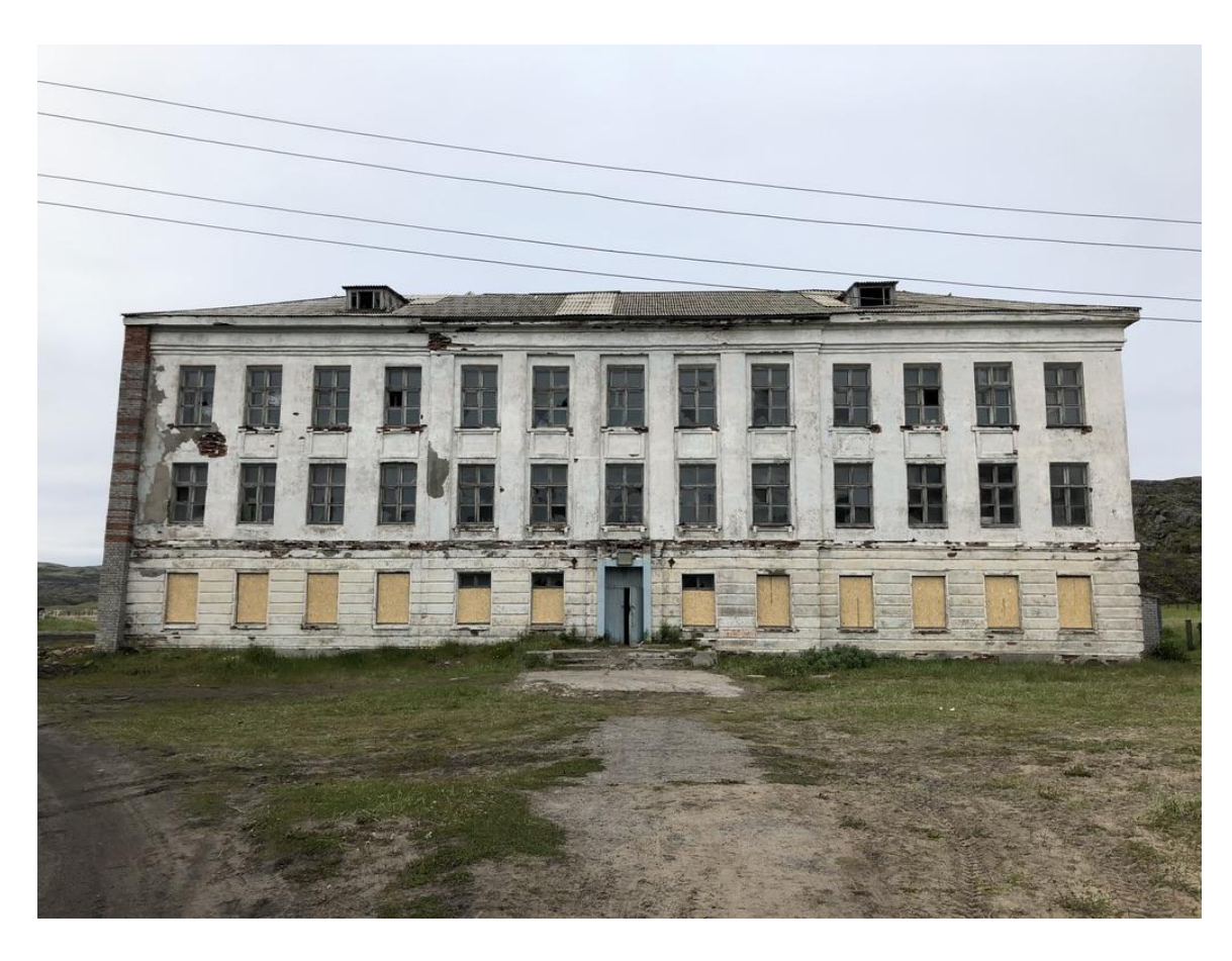
Figure 4. The abandoned school in Teriberka. July 15, 2019.

closing, all children were to transfer to the school in Lodeynoe. Those who were living in Teriberka, were provided a bus. "Wouldn't it be more expensive to transport children, maintain a garage, equipment, driver, mechanic, locksmiths, pay for gas, rather than teach them here?", wondered Hella Nurme. In addition, the school closure resulted in cutting off the heat and water feed for the kindergarten and two houses nearby that were supplied by the school boiler room (Murmansky Vestnik 2006).