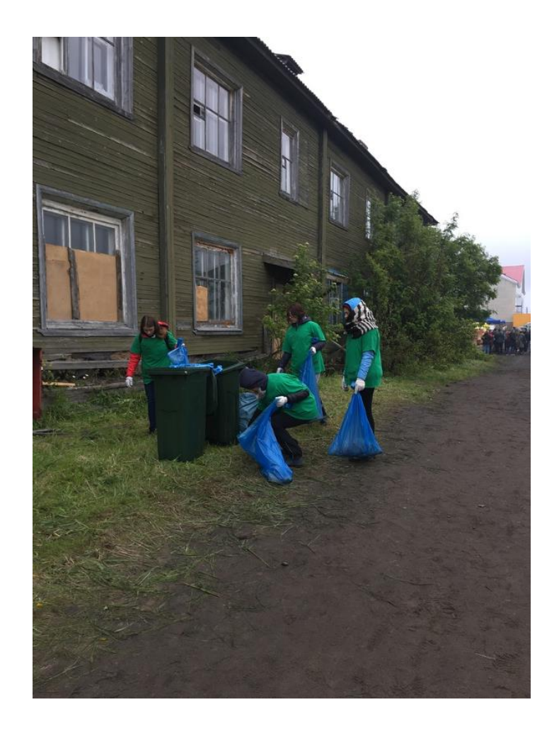
Figure 13. Volunteers collecting trash at the festival. July 14, 2019.

There was also no waste sorting at the festival. All kinds of trash were put in the regular green trash cans so there was no way to ensure that the collected waste materials would get recycled.