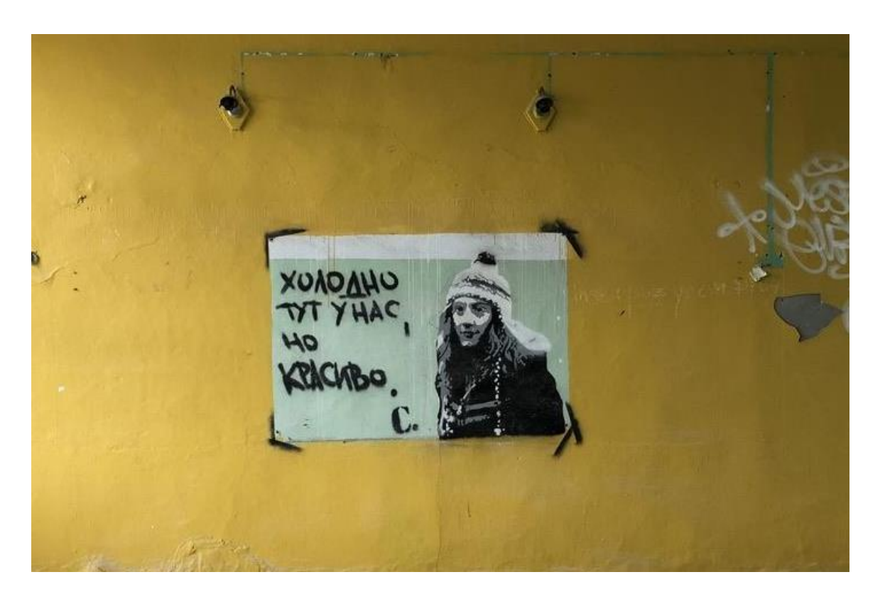
Figure 5. It's cold out here, but beautiful. July 15, 2019.

The school was abandoned in no time along with the desks and chairs, blackboards, and an enormous number of books. Many of them were taken by tourists and locals as souvenirs. The interior walls were covered in graffiti. The school became a local art object and a popular tourist attraction. One graffiti is especially popular - a young girl wearing a warm winter hat. It was drawn by an artist from Murmansk who came for the first festival in Teriberka in 2015. The graffiti says: "It's cold out here, but beautiful".