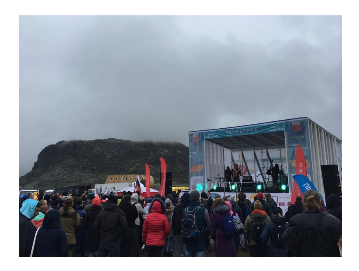
Figure 7. The main stage. July 13, 2019.

On the main stage, the festival was officially opened at 12am with the performance of the Teriberka Pomor Choir followed by the performances of Russian, American, and Norwegian music bands that went until 8pm.