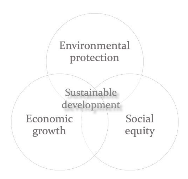
Figure 1. Three components of sustainable development. Created by Monakhova M.

The Brundtland Report identified three fundamental components essential for building policies and actions towards achieving sustainable development: the environment, economy and society. One common way to think of them is to imagine three intersecting spheres, dimensions, domains or pillars (see the figure below). Sustainable development brings positive changes that affect all of them resulting in environmental protection, economic growth and social equity (Brundtland 1987).