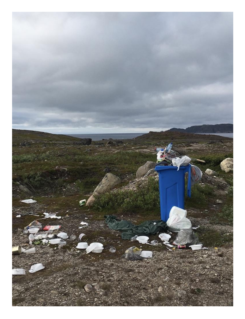
Figure 17. Former landfill in Teriberka. July 14, 2019.

Over the past few years, two restaurants have appeared in Teriberka, as well as the Ter' hotel (Personal Interview with Author, 07/19/2019). There is also an ongoing construction of several other new HoReCa venues that I observed during my trip to Teriberka.