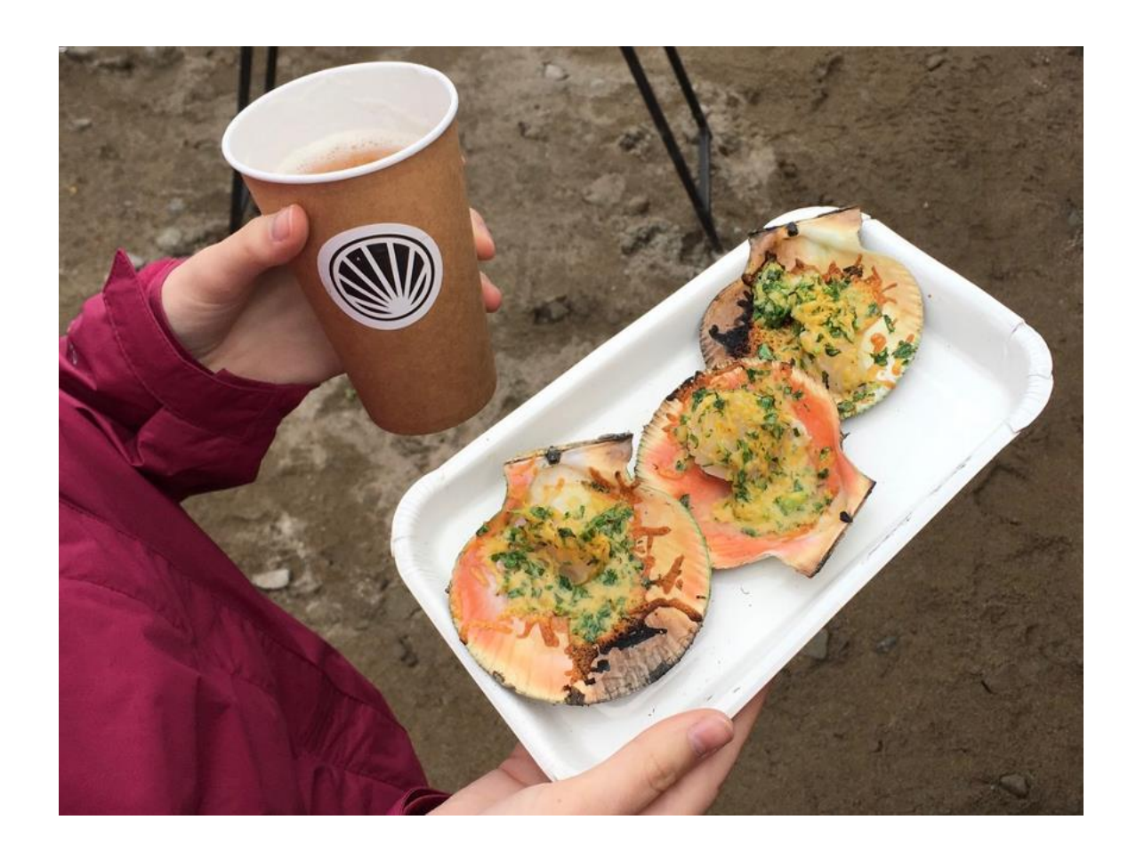
Figure 8. Sea scallops. July 13, 2019.

The beach activities included music performances, sports and recreation activities, contests, training classes, a flash mob, and an outdoor escape room. From 8pm to 11pm, there was a dance party with DJ sets entertaining the festival-goers.