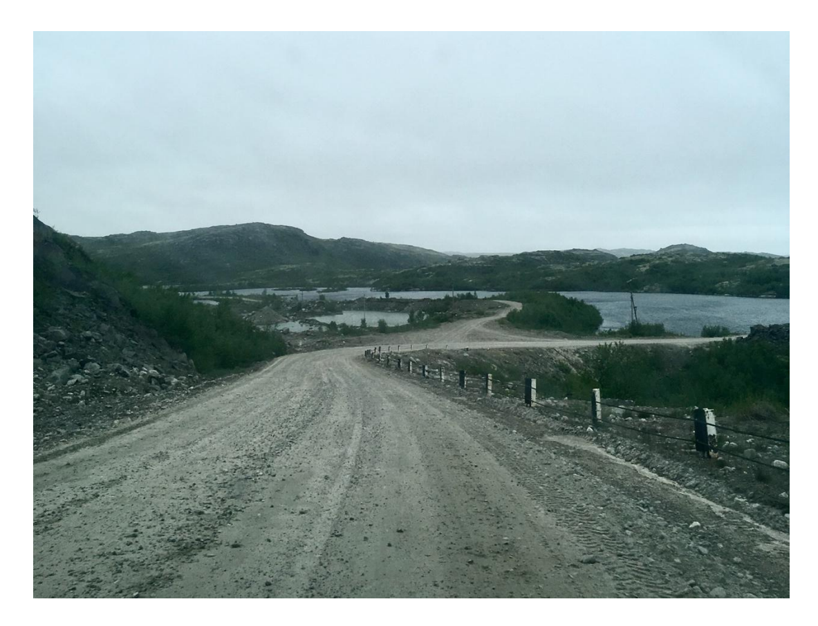
Figure 2. The unpaved section of the road from Murmansk to Teriberka. July 12, 2019.

snowplow that only comes once a day or, in the event of snowfall, makes an extra visit to clean the road for the bus according to its schedule.