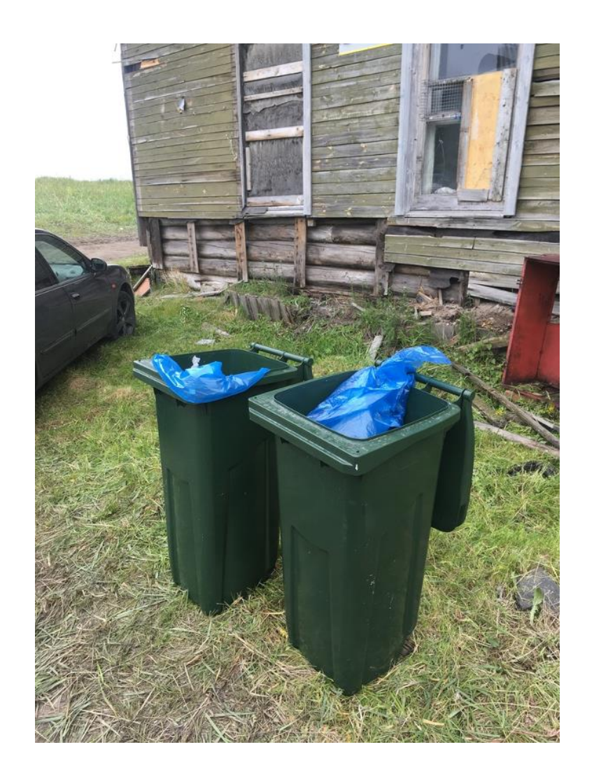
Figure 14. Garbage cans at the Teriberka festival. July 14, 2019.