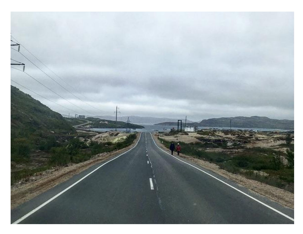
Figure 15. The asphalted road within the Teriberka village. July 12, 2019.

In addition, the 40 kilometers section of the road from Murmansk to Teriberka that is still unpaved was allocated 1.5 billion rubles (Vecherny Murmansk News 2020). They had expressed an intention to build it back when the Shtonman project was initiated but it never happened. Interviewee #3 thinks that thanks to ongoing tourism, "it is easier" to implement such projects. He also believes that with a fully paved road, tourism "will evolve even further" because now the main complaint coming from visitors is having a hard time getting to Teriberka (Personal Interview with Author, 07/19/2019).