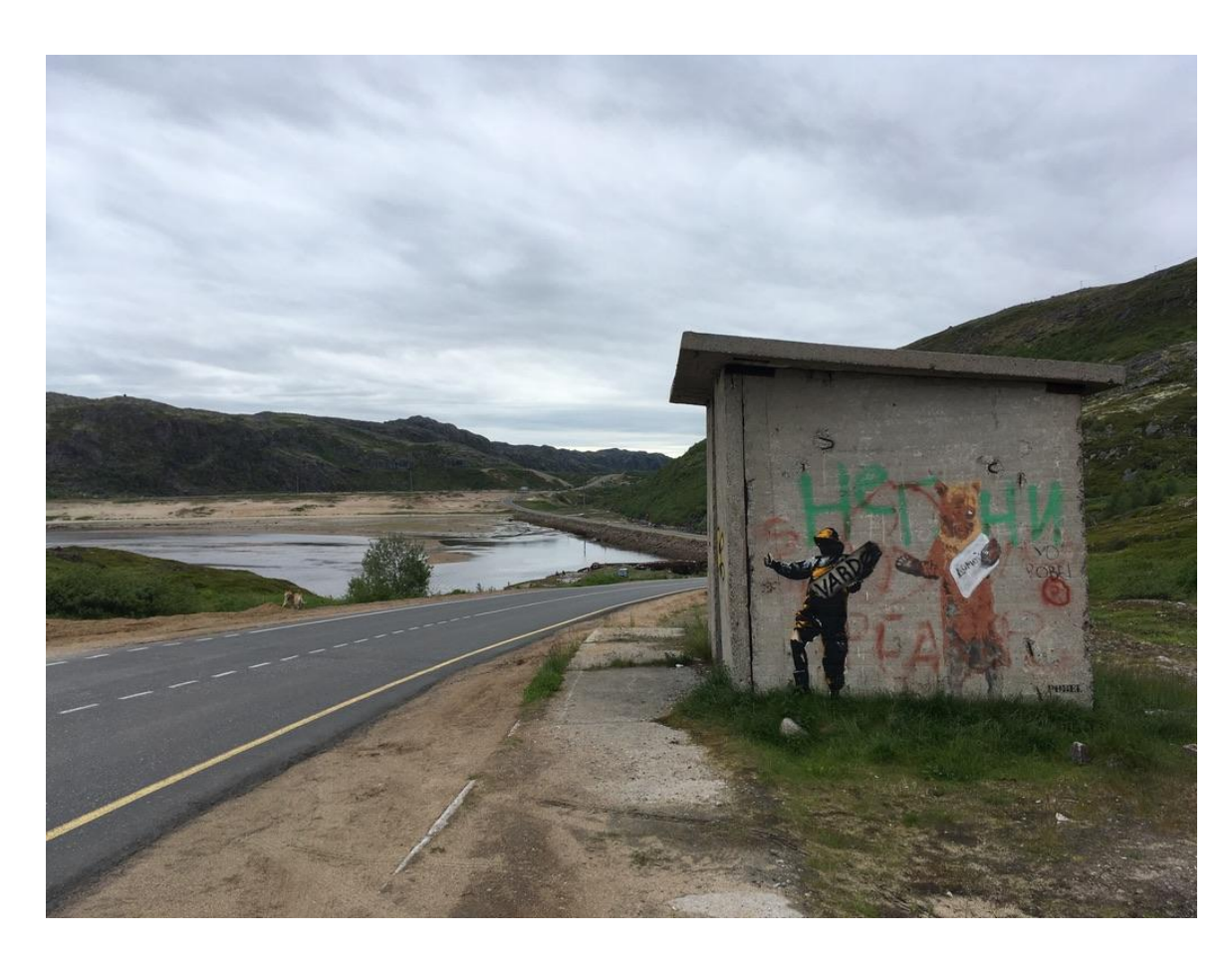
Figure 6. Graffiti by Pøbel at a bus stop in Teriberka. July 18, 2019.

In addition to Teribersky Bereg restaurant, a new hotel Ter' was opened in Teriberka in 2015; two more restaurants began being built. According to Akimov, the New Life was well received by the local residents who asked to "come back next year" (Afisha Daily 2015c).