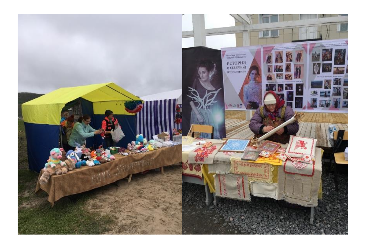
Figure 12. Festival vendors. July 13, 2019.

Trash was collected by volunteers who were brought to Teriberka by a separate bus. Volunteers were picking up the garbage throughout the festival; a final cleanup was conducted after the festival was over.