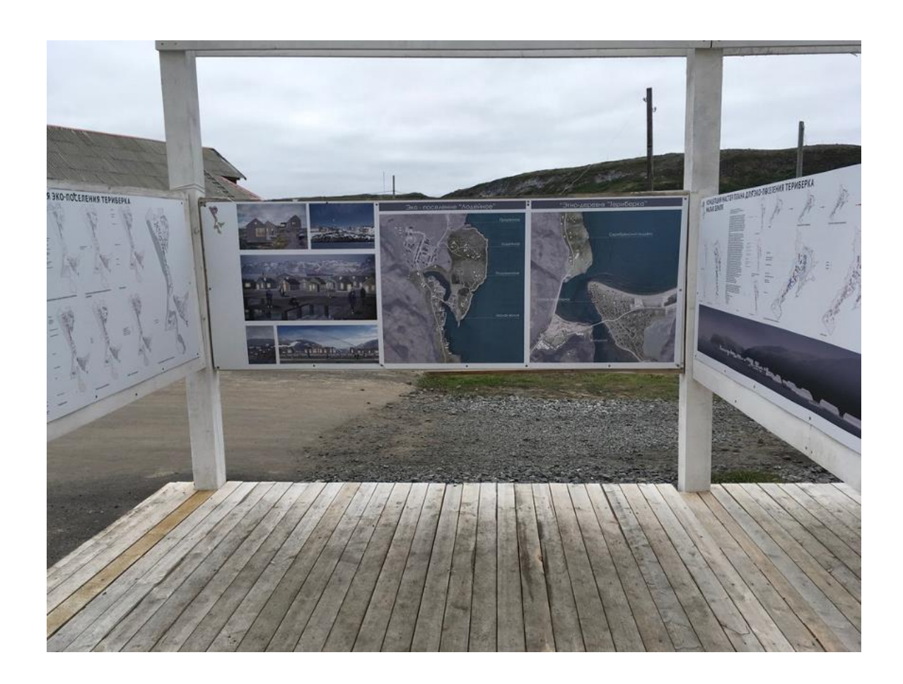
Figure 10. Teriberka's master plan of development put in front of the House of Culture. July 13, 2019.

At 3pm there was an installation of a plaque commemorating the first rescue station in Murmansk Oblast built in Teriberka in 1902. The ceremony was held in conjunction with the 100-year anniversary of the emergency services of Murmansk Oblast and also in order to publicize the rescue work among young people.