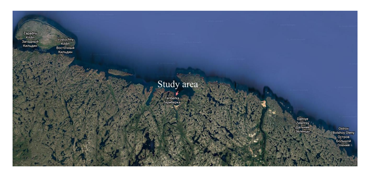
Figure 3. RST Teriberka (Google Earth, 04/03/2020).

Teriberka is located 130.8 km (81.3 miles) from Murmansk, a port city and the administrative center of Murmansk Oblast. Teriberka is the only place on the Russian side of the Barents Sea that can be reached by car. It used to be a closed military base but in 2009 it was open to the public. It is also the nearest to Murmansk coastal village that is free for visitors which makes it attractive for tourists (Tsylev 2015).