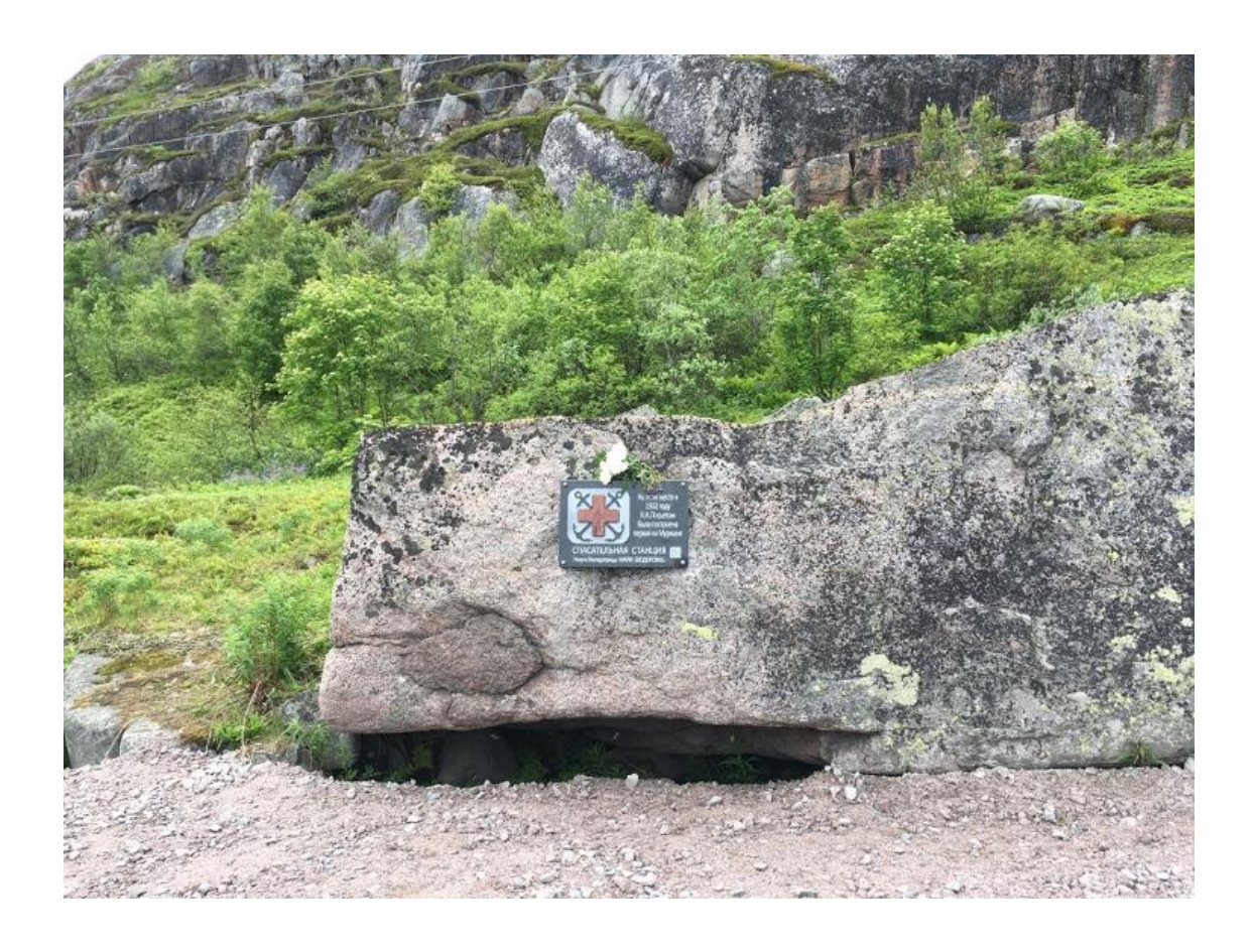
Figure 11. A plaque commemorating the first rescue station in Murmansk Oblast built in Teriberka in 1902. July 13, 2019.

The event has also engaged multiple local vendors from various nearby towns. They were not brought to the festival by federal projects; to participate in the Teriberka festival, they had to submit an application through the local administration. The vendors were selling all kinds of goods: from the festival themed T-shirts to hand-made toys and embroidery (see the picture below).