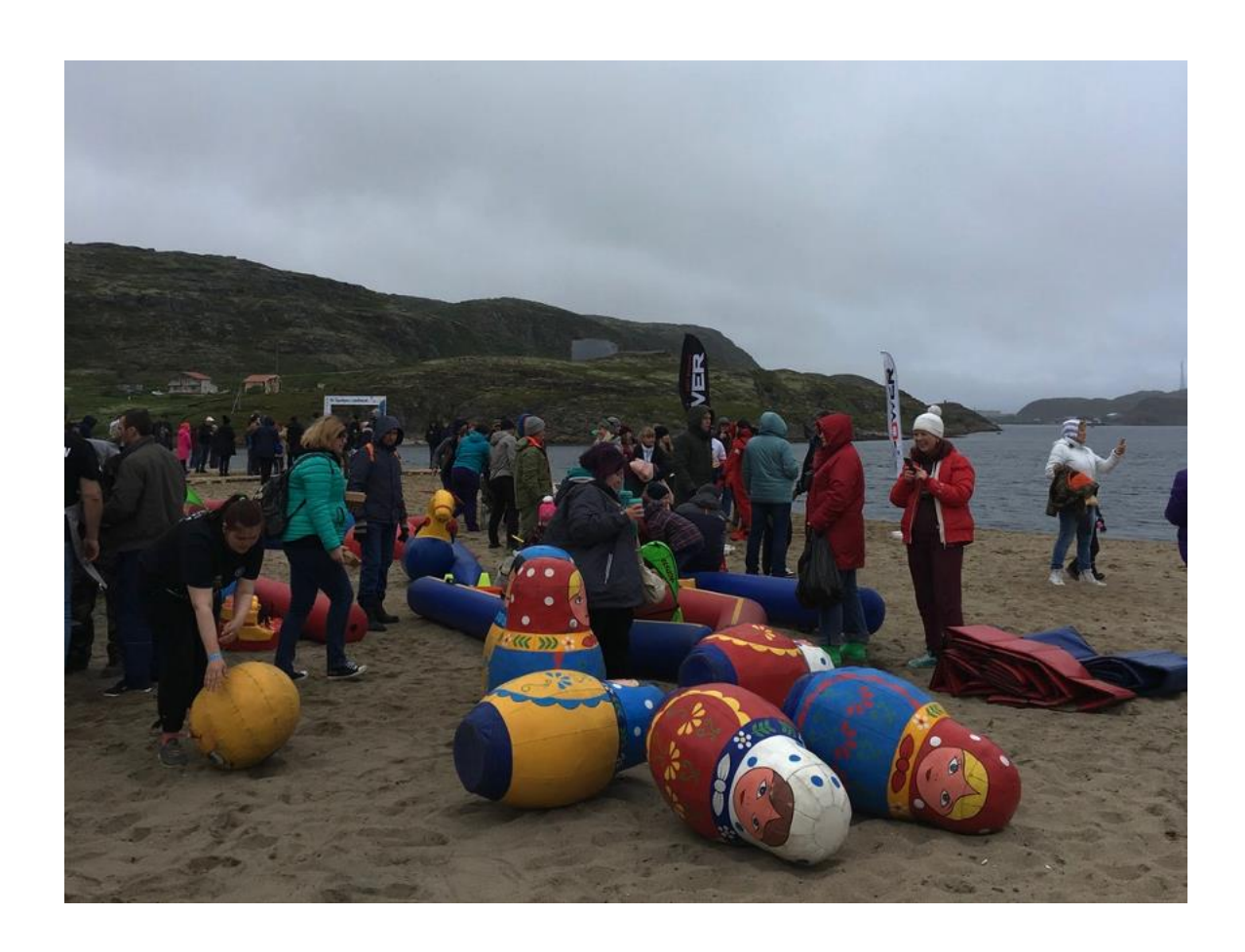
Figure 9. The beach area. July 13, 2019.

The House of Culture had become a venue for several exhibitions, a Murmansk Oblast library, hosted a trivia contest, and held a series of North-made films screenings. Posters of the master plan developed at the III Arctic festival had been put up in front of the House of Culture, informing people about the infrastructure planned projects in Teriberka.