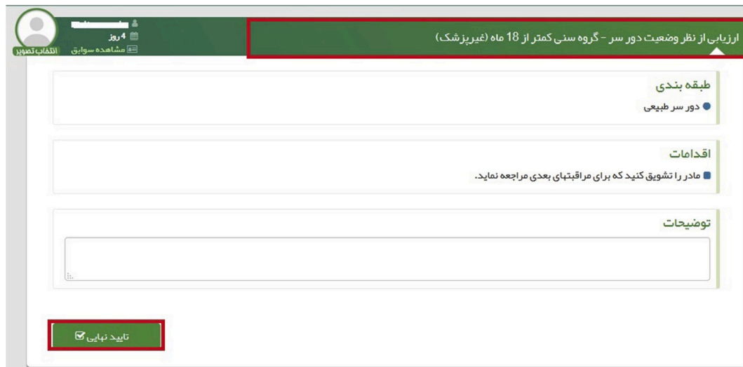
Fig. 3. Heuristic violations of Aesthetic and minimalist design.

to software in order to witness a usability improvement in this information system.