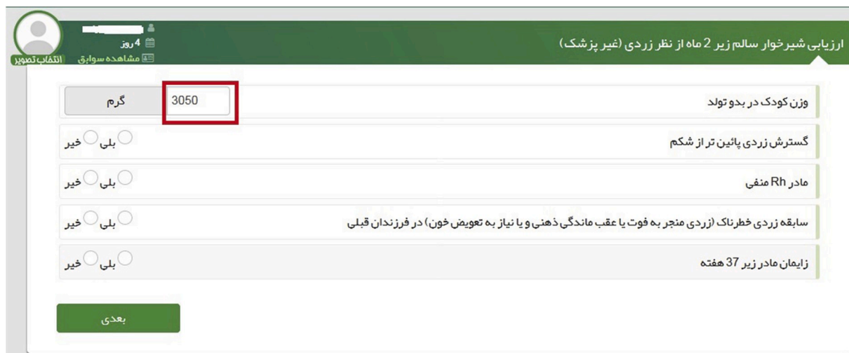
Fig. 2. Heuristic violations of consistency and standards.

Furthermore, the findings of this study revealed that the “help and documentation” principle had the most severe usability problem with a mean score of 3.4 and subsequently was considered as catastrophic. Similar to the present study, other studies carried out by Khajouiei, Atashi and Mirabootalebi [17,26,27] addressed a lack of “help and documentation” section in the system. Moreover, other researchers reported problems associated with this principle as catastrophic [9,13] and major [3,28–31]. Finally, in all of these studies, the problems associated with “help and documentation” were considered to be major; thus, the findings of the present study are consistent with the results mentioned in previous studies.