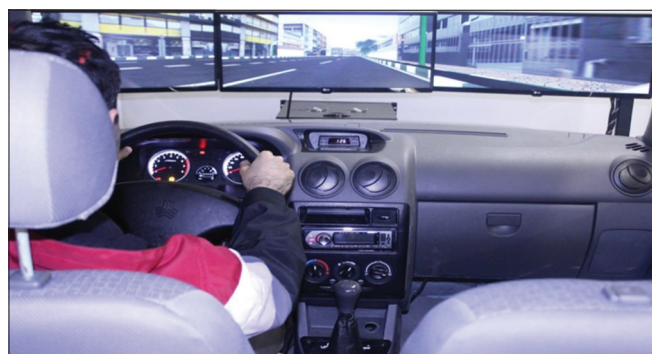
Figure 1: Driving simulator used in the study

Participants were fully informed of the test conditions and completed the consent form. They were provided with some