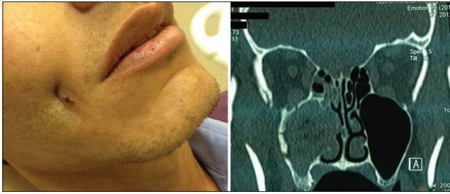
Figure 1: Facial appearance of the ulcer and computed tomography scan imaging showed intrasinus mass