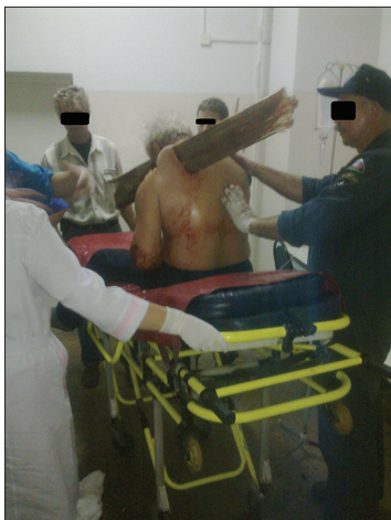
Figure 1: The patient with impalement thoracic injury on admission

Impalement injuries are defined as penetrating injuries where traumatic agent remains impaled in the human body. [2] Due to their rarity, the management of this clinical condition remains controversial. Impalement injuries are classified according to their mechanism and impaled regions (abdominal, thoracic,