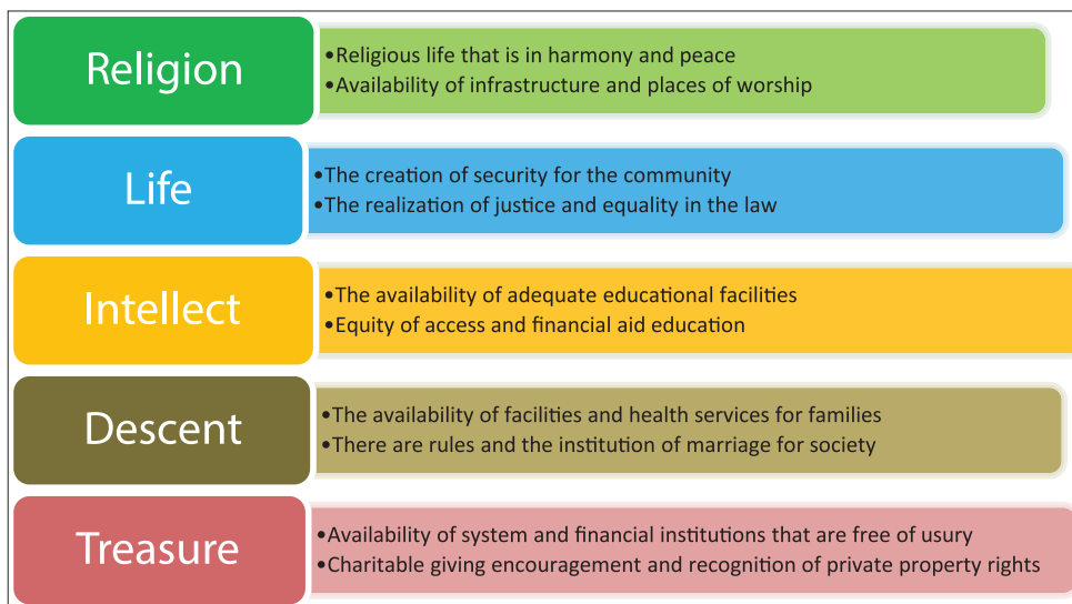
Figure 2: Indicators of Society Welfare Based Maqashid Shariah