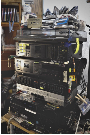
Stereo , Digital Photograph, 17"x11", 2020, Murt_Stereo.jpeg