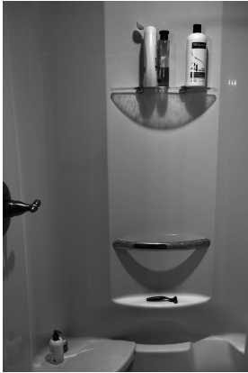
Shower , Digital Photography, 17"x11", 2020, Murt_Shower.jpeg