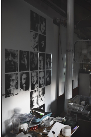
Celebrity , Digital Photograph, 17"x11", 2020, Murt_Celebrity.jpeg