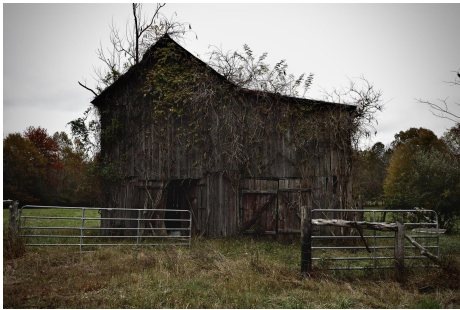
Untitled 1 , Digital Photograph, 24"x18", 2020, Murt_Untitled.jpeg