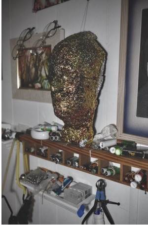
Battery Storage , Digital Photograph, 17"x11", 2020, Murt_BatteryStorage.jpeg