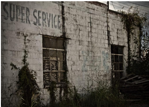
Super Service , Digital Photograph, 18"x24", 2018, Murt_SuperService.jpeg