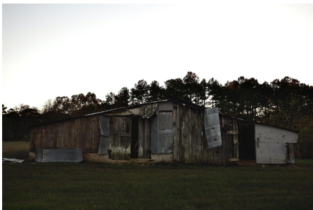
Untitled 3 , Digital Photograph, 17"x11", 2020, Murt_Untitled3.jpeg