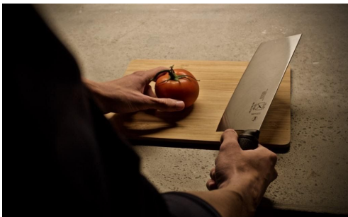
Tomato , Digital Photograph, 18"x24", 2018, Murt_Tomato.jpeg