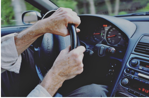
NSX , Digital Photograph, 18"x24", 2018, Murt_NSX.jpeg