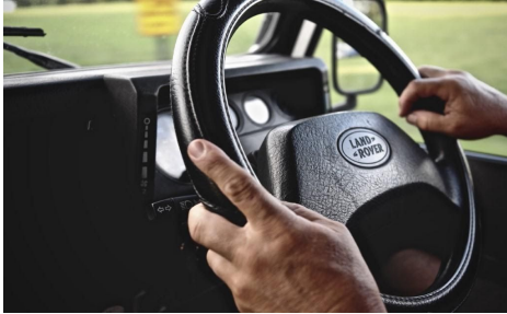
Defender , Digital Photograph, 12"x18", 2020, Murt_Defender.jpeg