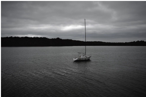
Lonely Island , Digital Photograph, 12"x18", 2020, Murt_LonelyIsland.jpeg