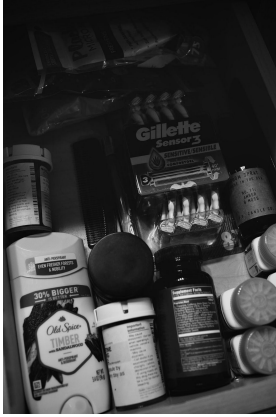
Bathroom Drawer , Digital Photography, 17"x11", 2020, Murt_BathroomDrawer.jpeg