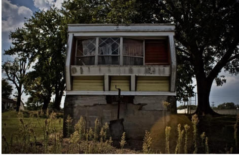
Mobile Home , Digital Photograph, 12"x18", 2018, Murt_MobileHome.jpeg