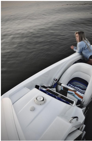
On a Boat , Digital Photograph, 17"x11", 2020, Murt_OnaBoat.jpeg