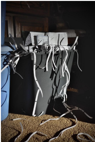
Shredder , Digital Photograph, 17"x11", 2020, Murt_Shredder.jpeg