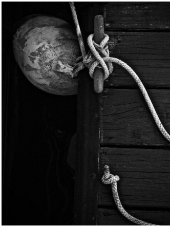
Dock , Digital Photograph, 36"x24", 2018, Murt_Dock.jpeg