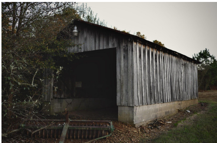
Untitled 4 , Digital Photography, 17"x11", 2020, Murt_Untitled4.jpeg