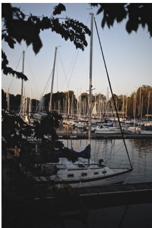
Harbor , Digital Photograph, 17"x11", 2020, Murt_Harbor.jpeg