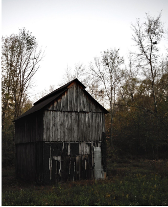
Untitled 2 , Digital Photograph, 17"x11", 2020, Murt_Untitled2.jpeg