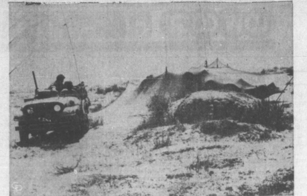
HEEP-MOUNTED Israeli soldiers take a look at a camouflaged point on Egyptian border.