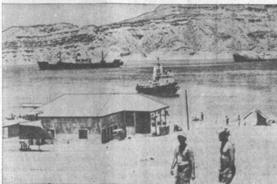
BLOCKADE BREAKER—The Israeli freighter Dolphin enters the Gulf of Aqaba escorted by an Israeli torpedo boat off Sharm-el-Sheikh, captured Egyptian fortress.

June 19 8:30 Mon. Nile Movie 8:00 Felony Squad 8:30 Peyton Place 9:00 The Big Valley 10:30 Lawman 11:30 Everglades