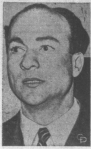
NO. 2 MAN in Cairo seems to be U.A.R. Vice President Zakaria Mohieddin (above), who was suggested as a replacement by President Gamal Abdel Nasser when he resigned, but before he was resigned. Mohieddin, 47, was a cohort of Nasser's during the overthrow of King Farouk in 1952.