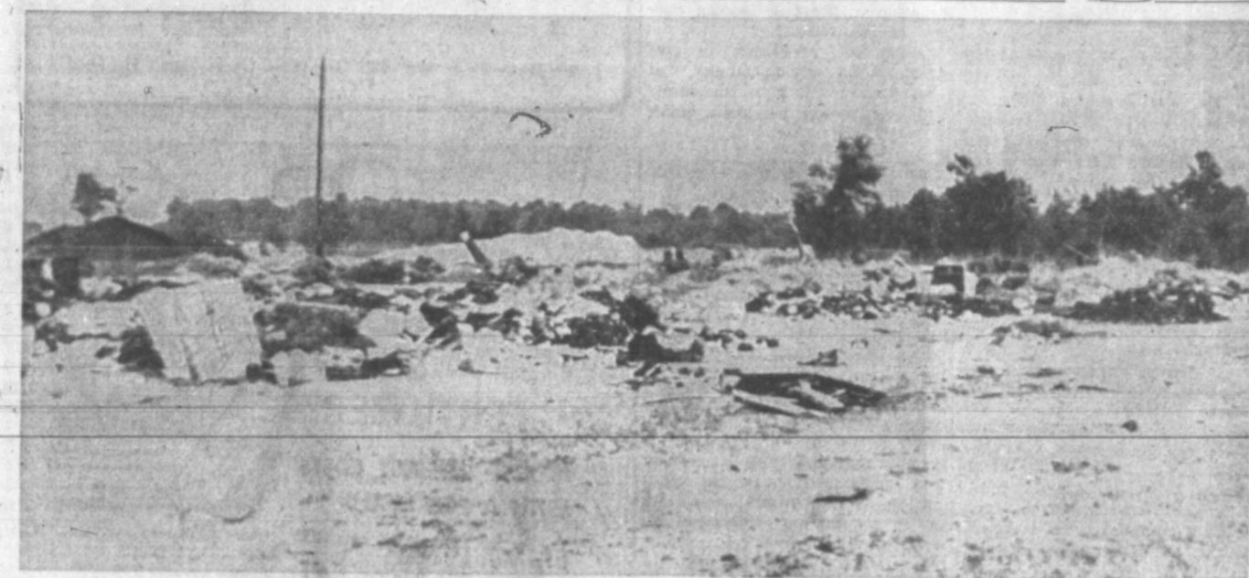
This is a view of the area directly north of the Murray Sewer System plant on the East Highway. This area is under consideration for annexation to the city of Murray in order that the city will have control over the dumping of trash. The area now has the appearance of a gully dump. The city disposes of all its garbage through use of a sanitary land-fill method in which garbage is covered with dirt each evening.